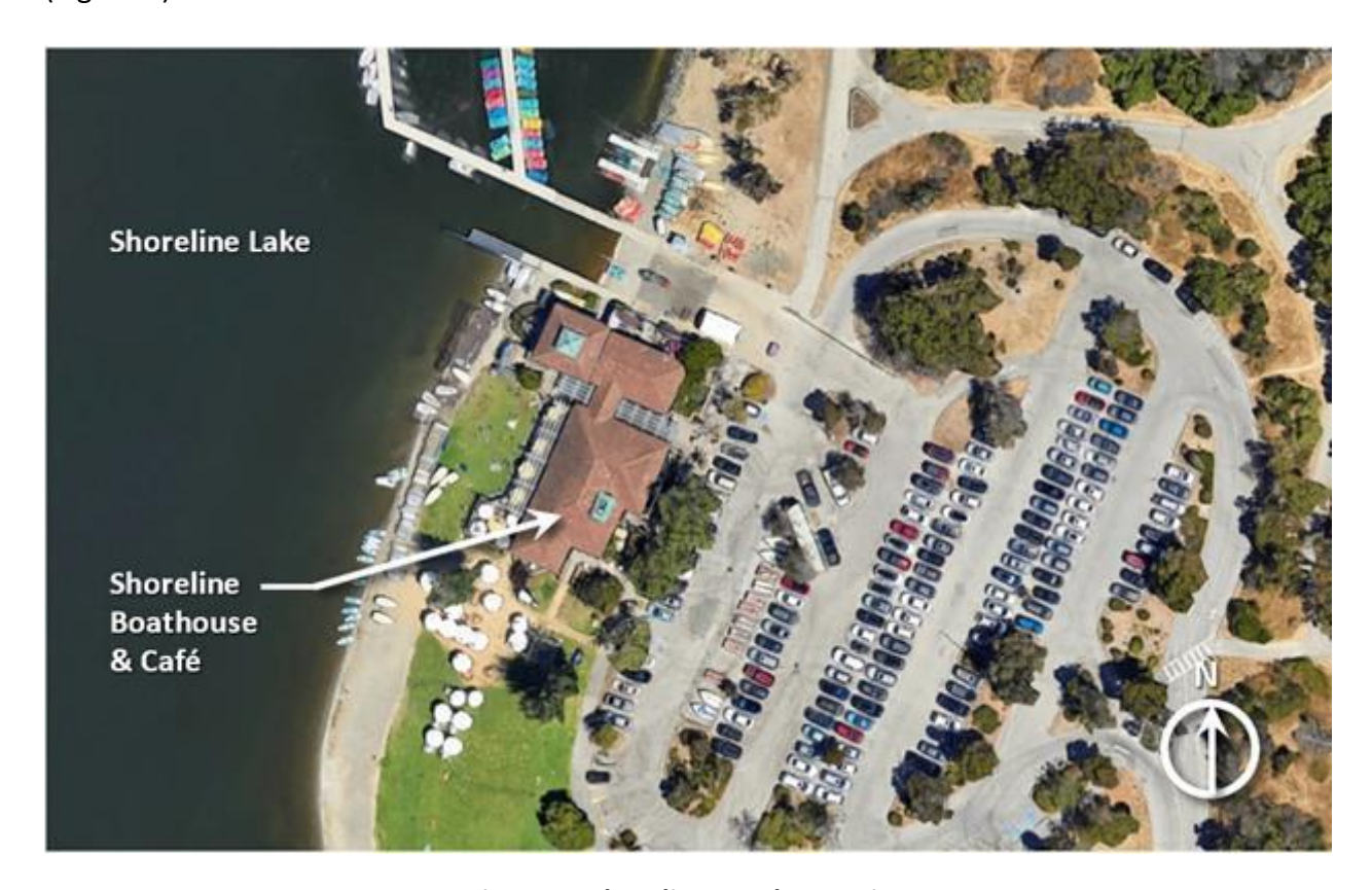
Figure 1: Shoreline Boathouse Site

Shoreline Boathouse is located at 3160 North Shoreline Boulevard, Mountain View, CA 94043 (Figure 1). The Boathouse is located off the shore of Shoreline Lake at the Shoreline.