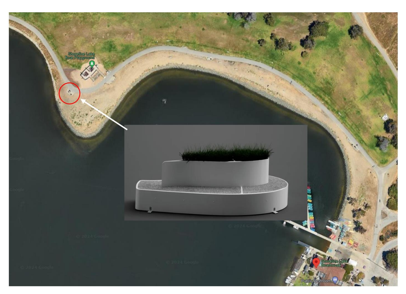
Figure 4: Additional Art Opportunity at Shoreline at Mountain View