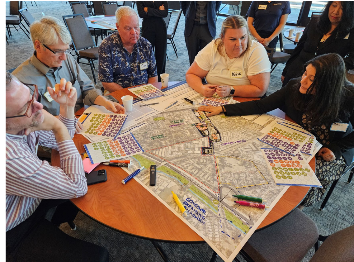
Property Owner/Business Owner/Business Association Stakeholder Meeting, September 4, 2024 Mountain View Community Center

The first meeting was with property and business owners, and the second meeting was with Mountain View-based organizations and associations.