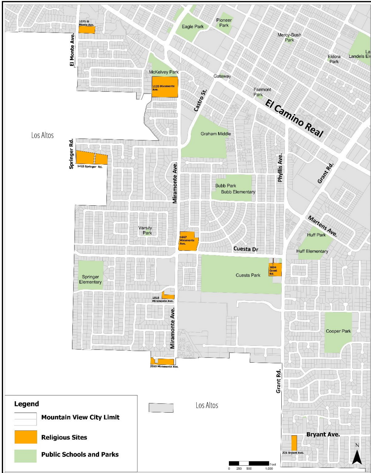
Figure 1: Religious Sites South of El Camino Real