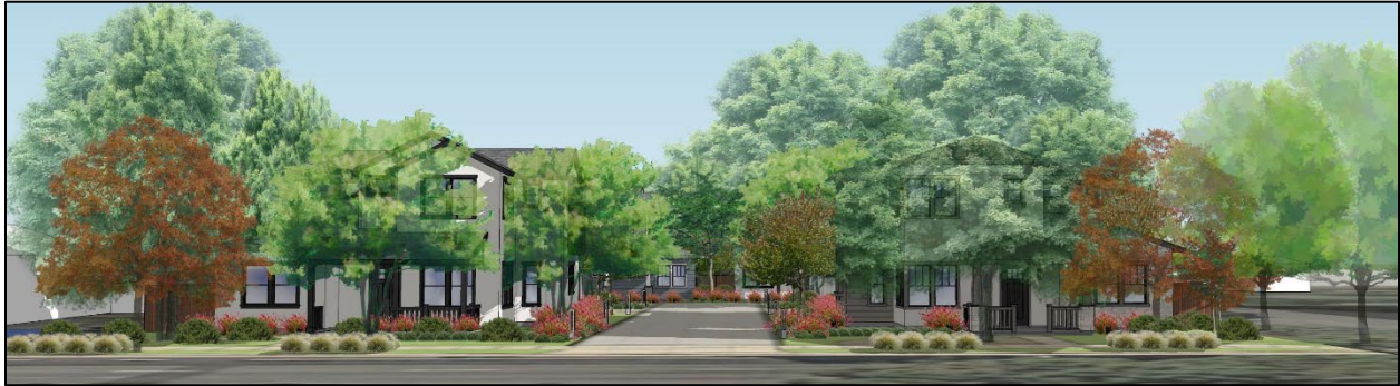
Figure 3: View from Cuesta Drive