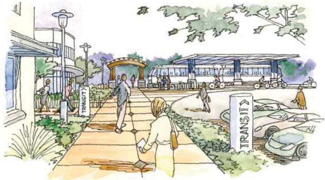
Pedestrian connections to transit