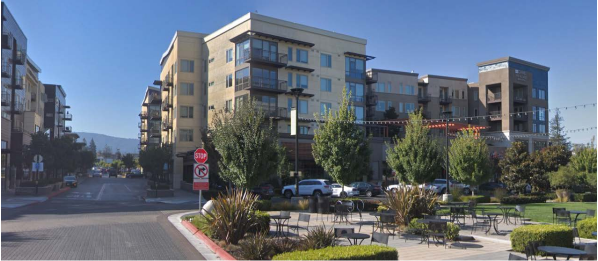
12. 400 San Antonio Road – Prometheus (Developer); Studio T-Square (Architect) 5-7 stories, 2.50 FAR (mixed-use project), 583 units (with State density bonus) Status: Approved September 2016. Under-construction.