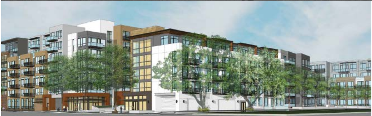
13. 394 Ortega Avenue- Anton Development Co. (Developer); TCA (Architect) 4 stories, 1.84 FAR, 144 units Status: Approved September 2016. Under-construction.