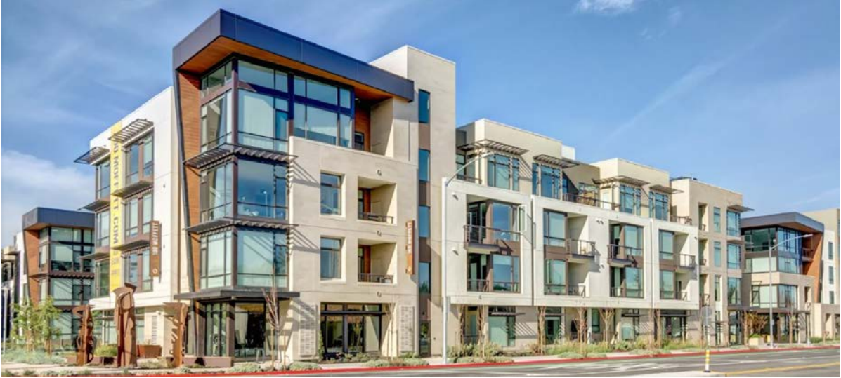
17. 500 Ferguson Drive (South Whisman) – EFL (Developer); KTGy (Architect) 4 stories, 1.55 FAR, 394 units (2 buildings, with 3,000 SF retail) Status: Approved June 2015. Under-construction.