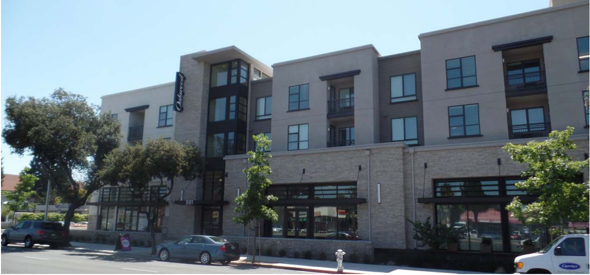
5. 1984 W. El Camino Real – UDR (Developer); Steinberg Architects 3-4 stories, 1.84 FAR (El Camino Parcel) & 1.62 (Latham Parcel), 160 units Status: Approved November 2013. Completed and Occupied.