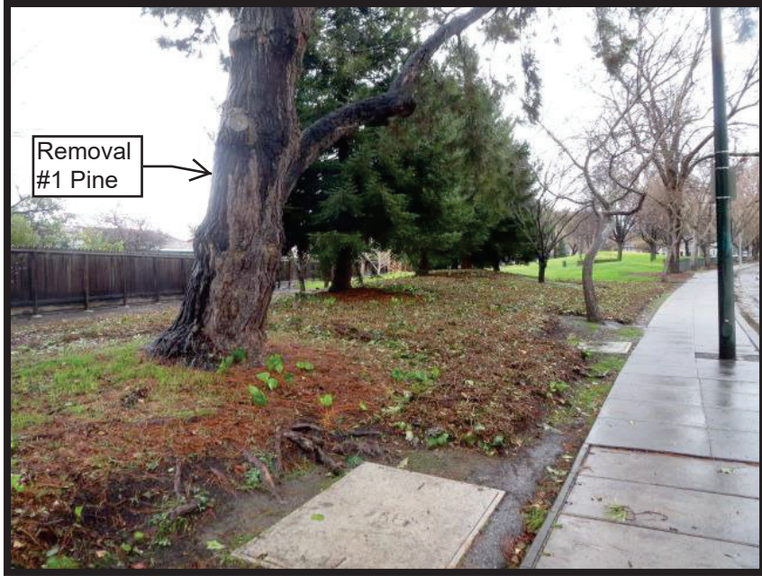
Figure 1. VP_13165- Removal