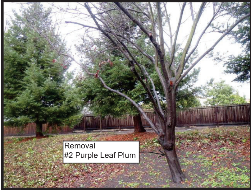
Figure 3. VP_11912- Removal