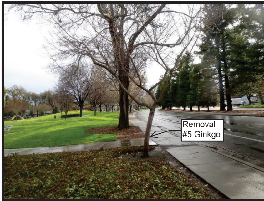
Figure 4. VP_11913- Removal