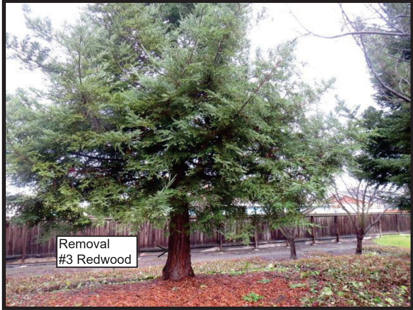
Figure 5. VP_11909- Removal