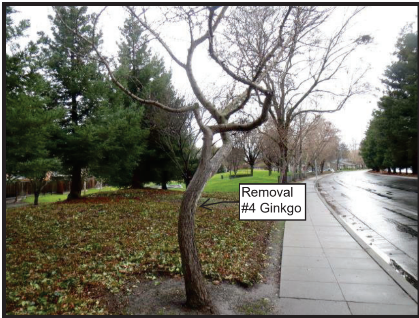
Figure 2. VP_11907- Removal