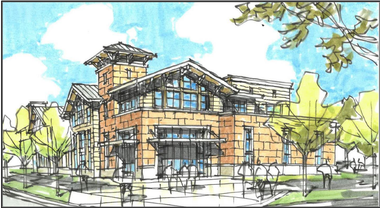
Figure 3: Civic—Americana Architectural Style

On June 25, 2024 , Council adopted Resolution 18908 to place a revenue measure (Measure G) on the November 2024 ballot and other related actions to secure additional funding for the Public Safety Building project as well as other Citywide funding needs if approved by voters.