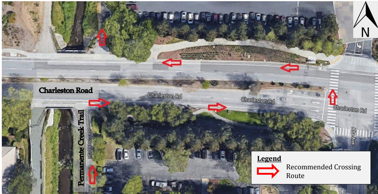
Figure 1: Existing Condition at Permanente Creek and Charleston Road

The alternatives for Charleston Road crossing improvements included a bridge, an undercrossing, and an at-grade crossing with a traffic signal. The bridge alternative was significantly more expensive than the other two alternatives, created visual impacts, and required significant tree removal. The undercrossing alternative provided good separation between trail users and vehicles, but was more expensive than the at-grade crossing option and required removal of approximately 20 trees.