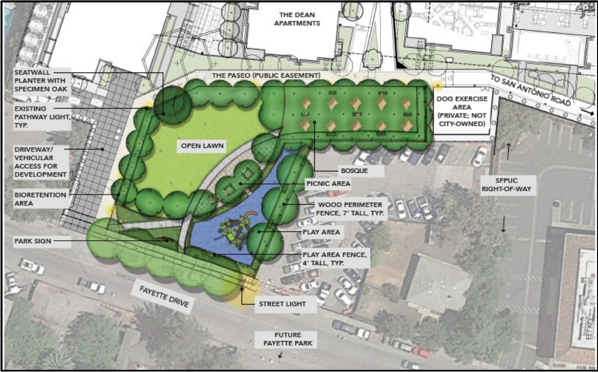
Figure 3: Concept Plan E