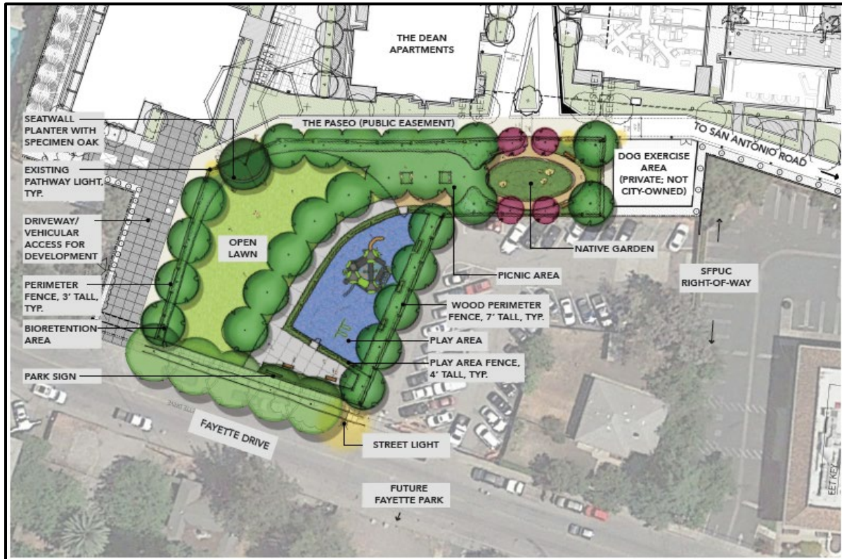
Figure 2: Concept Plan D

Plan E (see Figure 3) includes a bosque, or group trees, to provide a shaded gathering space. Concept Plan F (see Figure 4) is similar to Concept Plan E in the features provided but proposes a different location for the picnic area, a reduced-size bosque, and a larger play area.