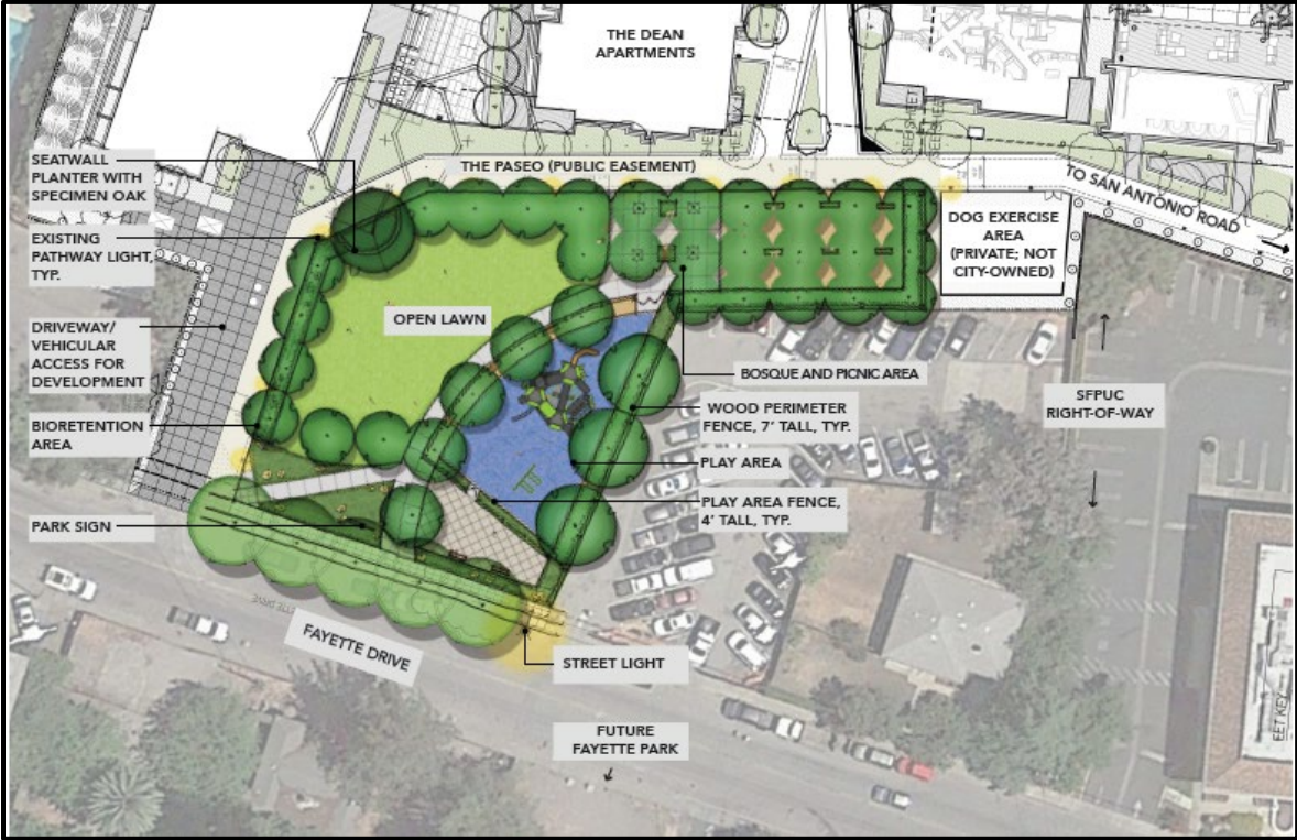
Figure 4: Concept Plan F