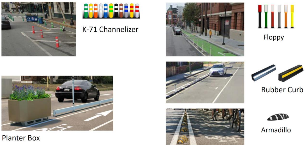
Figure 2: Vertical Treatments

Attachment 1 shows the layout of the corridor improvements, incorporating the revisions noted above. Attachment 2 outlines in table format the vertical treatments to be applied to each corridor segment.