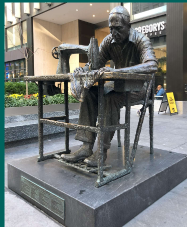
Statue recognizing garment workers in Manhattan

Public art is a part of our public history, part of our evolving culture and our collective memory. It reflects and reveals our society and adds meaning to our cities.