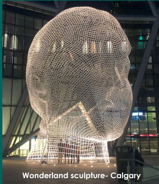
Wonderland sculpture- Calgary

Privately-owned public accessible (POPA) are publicly accessible spaces in the form of plazas, terraces, atriums, small parks, which are provided and maintained by private developers.