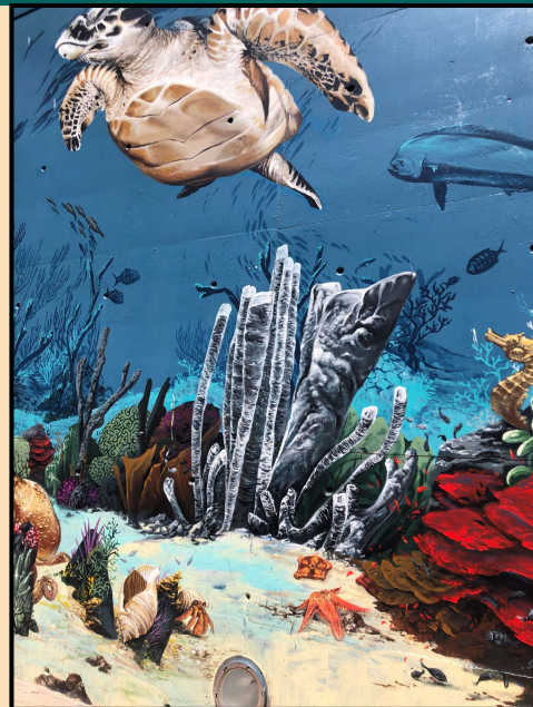
Tunnel Walkway in Cartagena, Spain

Murals- Urban art murals are integral to any city's uniqueness and identity.