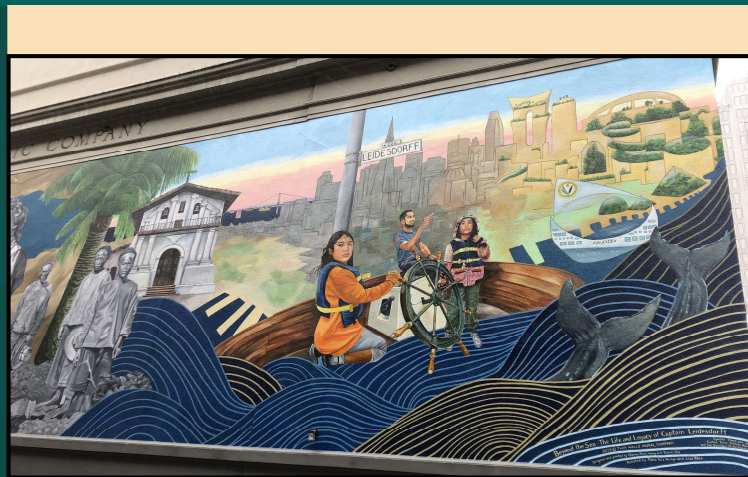
Mural on Leidesdorff Street in San Francisco

The history of murals in the United States, with its grand scale and public visibility, has served as a powerful medium for expression and storytelling throughout history.