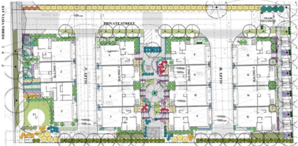
Landscape Site Plan