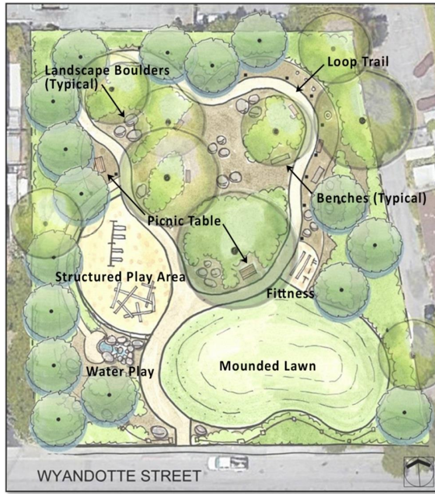
Figure 2 – Recommended Concept Plan A

On September 12, 2018, the Parks and Recreation Commission (PRC) reviewed the proposed conceptual plan, heard input from the community, and unanimously recommended that the City Council approve Concept Plan A, as shown in Figure 2.