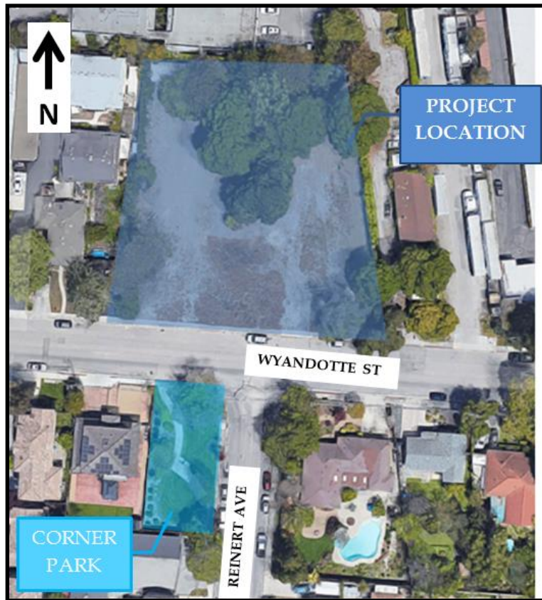
Figure 1 – Project Location