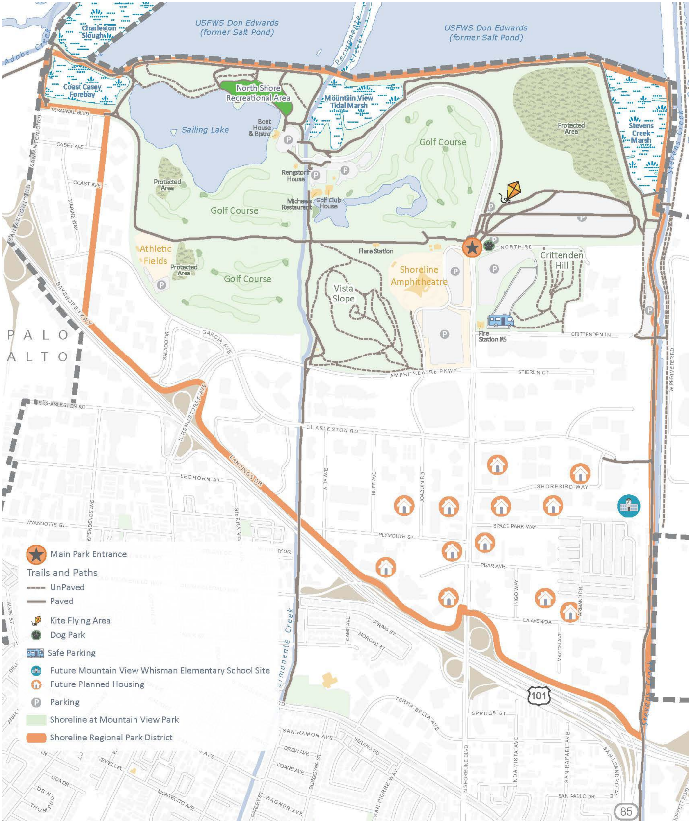
Figure 1: North Bayshore Plan Area Map