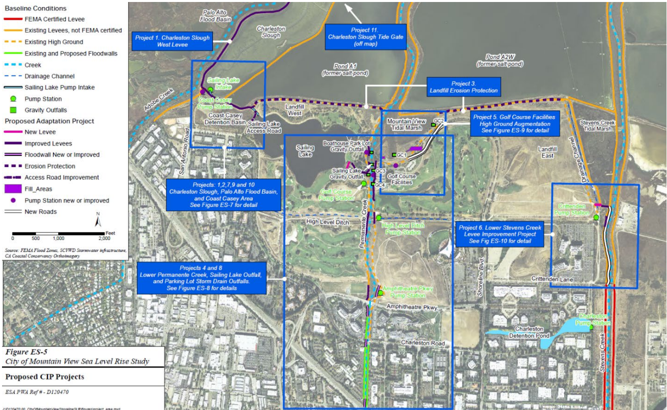
Figure 3: Shoreline Sea Level Rise Study Project Map

Specific details of planned flood control and sea level rise projects can be found in the Shoreline Sea Level Rise Study and Shoreline Regional Park Community Capital Improvement Program.