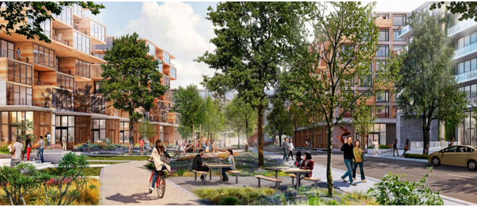
Rendering of potential mixed-use development in the North Bayshore Area.