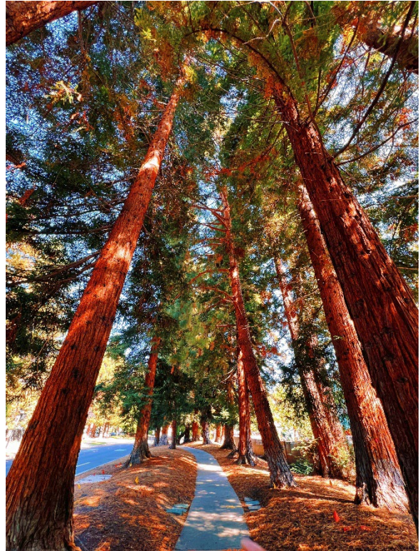
Native redwoods shade a pedestrian path in the North Bayshore area.

Specific details and maps describing land use policies and zoning for open space and parks can be found in the General Plan, North Bayshore Precise Plan, Google North Bayshore Master Plan, and Gateway Master Plan.