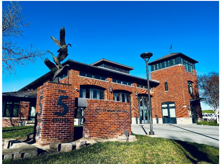
Fire Station 5 at 2195 N. Shoreline Boulevard

The North Bayshore Area is currently served by one fire station (Fire Station #5) and receives Police and Library services from the downtown/civic center area of Mountain View. In addition, the North Bayshore Area is served by the centralized Police and Fire Administration building, which also houses citywide dispatch and the emergency operations center. Additionally, new capital improvements projects and maintenance of existing public infrastructure, utilities, and facilities in the North Bayshore and Mountain View at Shoreline Regional Park require management and staffing, which is administered through a Memorandum of