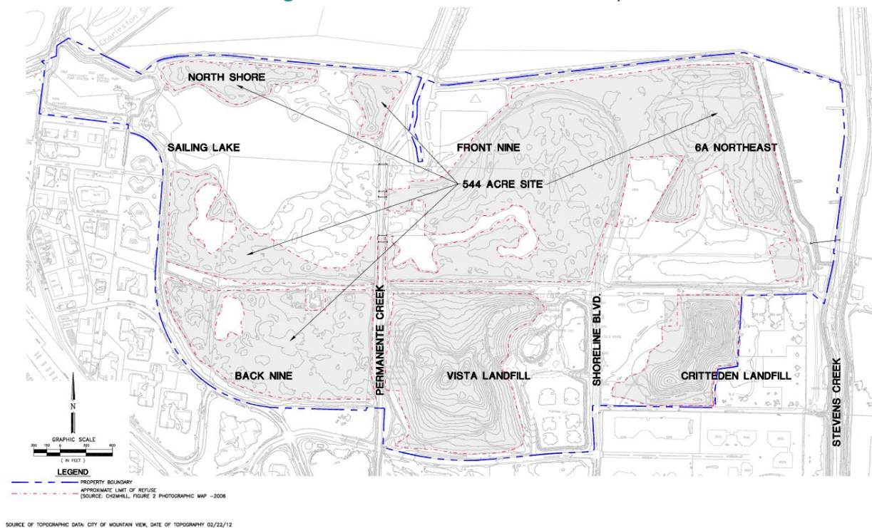
Figure 4: Shoreline Closed Landfill Map

Specific details of long-term funding obligations associated with the closed landfill can be found in the Shoreline Landfill Master Plan and Shoreline Regional Park Community Capital Improvement Program.