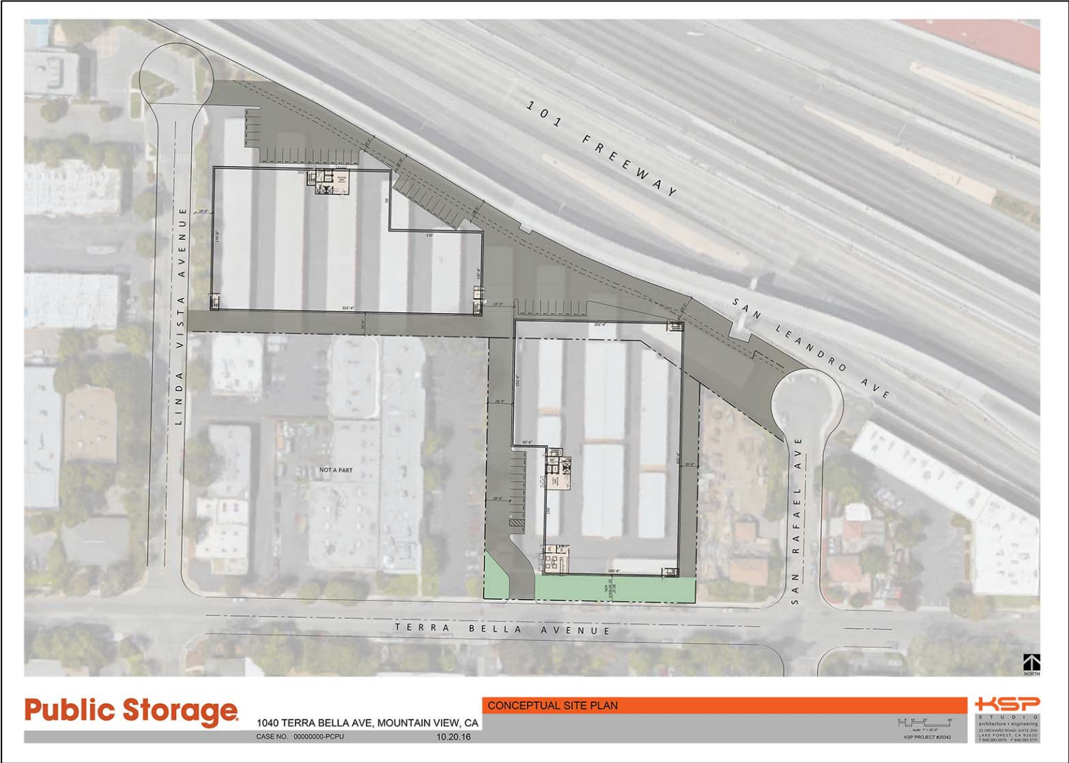
Exhibit B Propose site plan

PUBLIC STORAGE - Real Estate Group 701 Western Ave., Glendale, CA 91201 Tel: (818) 244-8080, Fax: (818) 543-7341 www.publicstorage.com