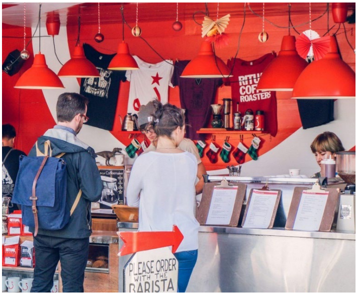
Precedent Imagery Examples