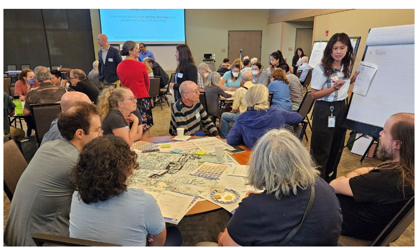
Community Visioning Workshop, August 28, 2024 Mountain View Community Center