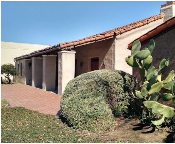
Precedent Imagery Examples