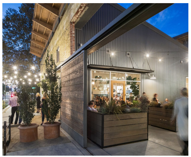
Precedent Imagery Examples