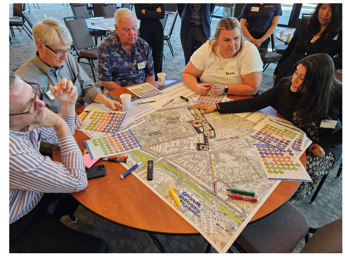
Property Owner/Business Owner/Business Association Stakeholder Meeting, September 4, 2024 Mountain View Community Center

The first meeting was with property and business owners, and the second meeting was with Mountain View-based organizations and associations.