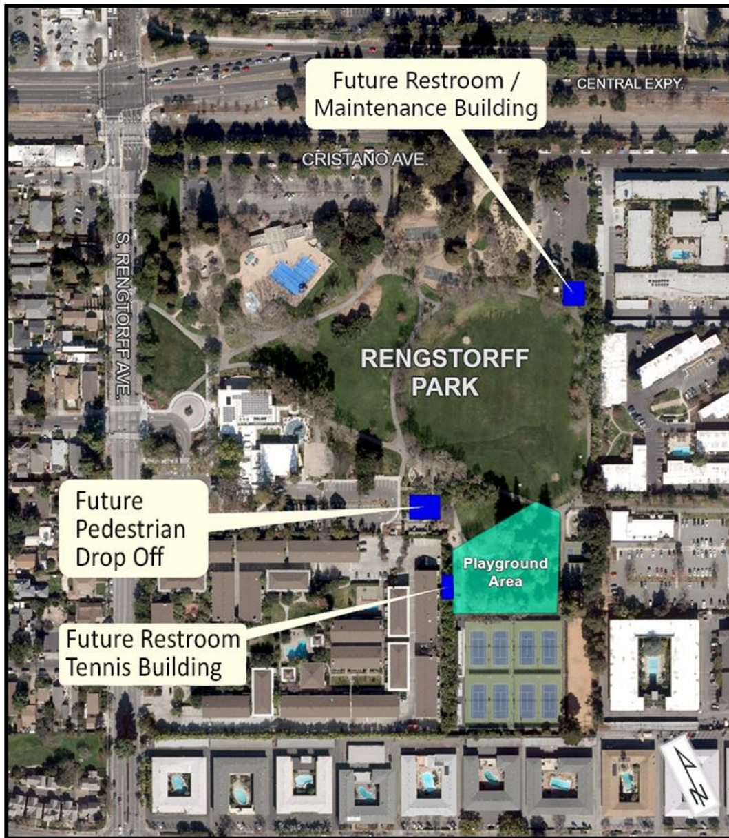
Figure 1 – Project Site Map