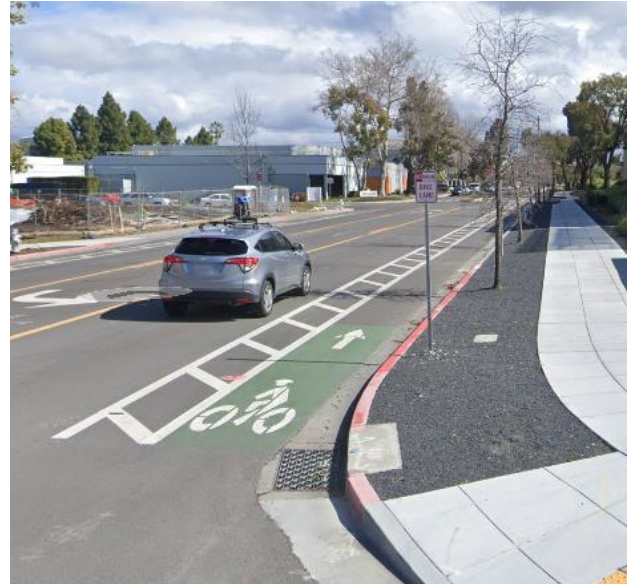
Figure 4: Class II Bike Lane (conventional bike lane left; buffered bike lane right).