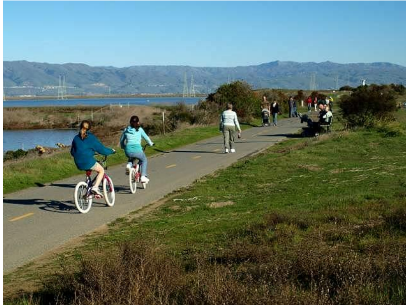
Figure 3: Class I Multi-Use Trail