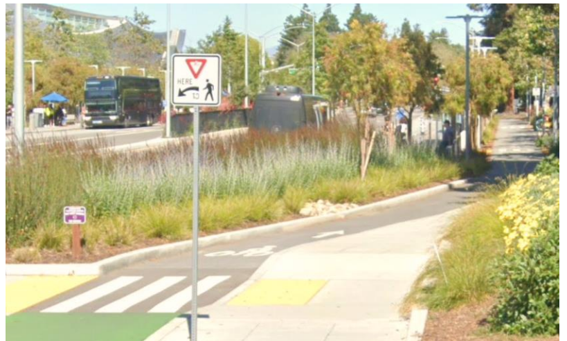
Figure 6: Class IV—Protected Bikeway