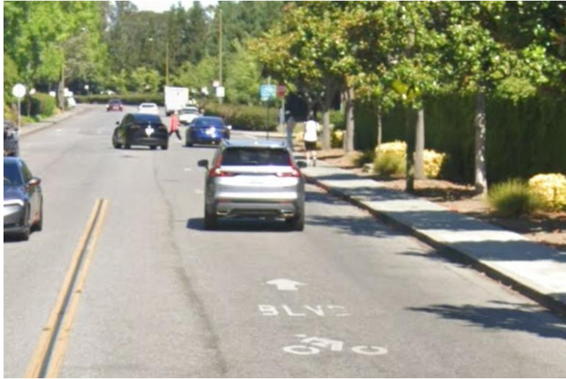
Figure 5: Class III—Bike Boulevard