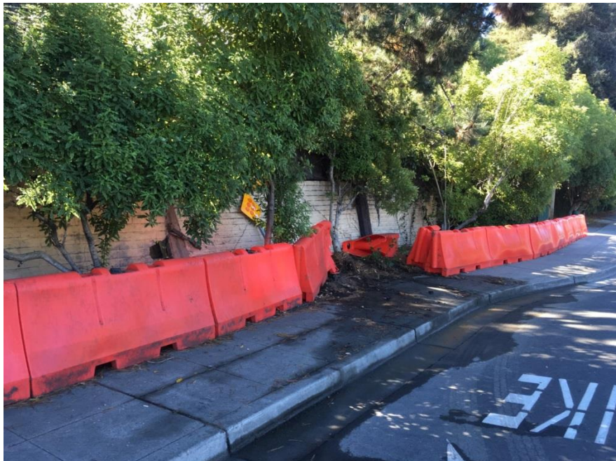
Figure 3 – Vehicle Collision at East Dana Street/Moorpark Way

The City has provided temporary measures by installing a water-filled barrier system at both intersections in 2016 (see Figures 3 and 4). These barriers have been hit and replaced.