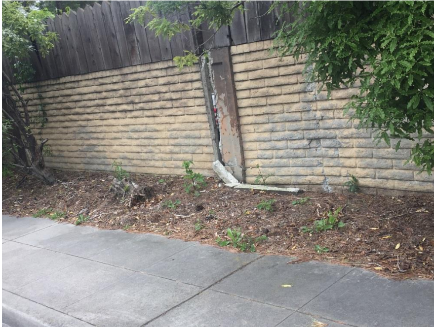
Figure 2 – Vehicle Collision at East Dana Street/Moorpark Way

The City has provided temporary measures by installing a water-filled barrier system at both intersections in 2016 (see Figures 3 and 4). These barriers have been hit and replaced.