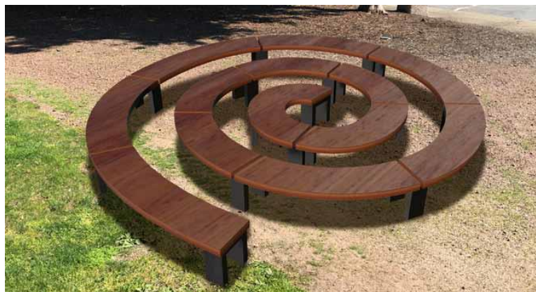
Figure 4 – Belanger Concept