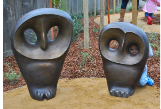
Figure 2 – Osteras-Constable Concept

At the April 10, 2019 VAC meeting, proposals were reviewed and ranked with consideration of suitability and durability for an outdoor public park setting. The VAC selected a bronze sculpture of two owls by Ene Osteras-Constable (see Figure 2 – Osteras-Constable Concept) as the top choice, followed by benches submitted by two artists Marisha Farnsworth (see Figure 3 – Farnsworth Concept) and Damon Belanger (see Figure 4 – Belanger Concept).