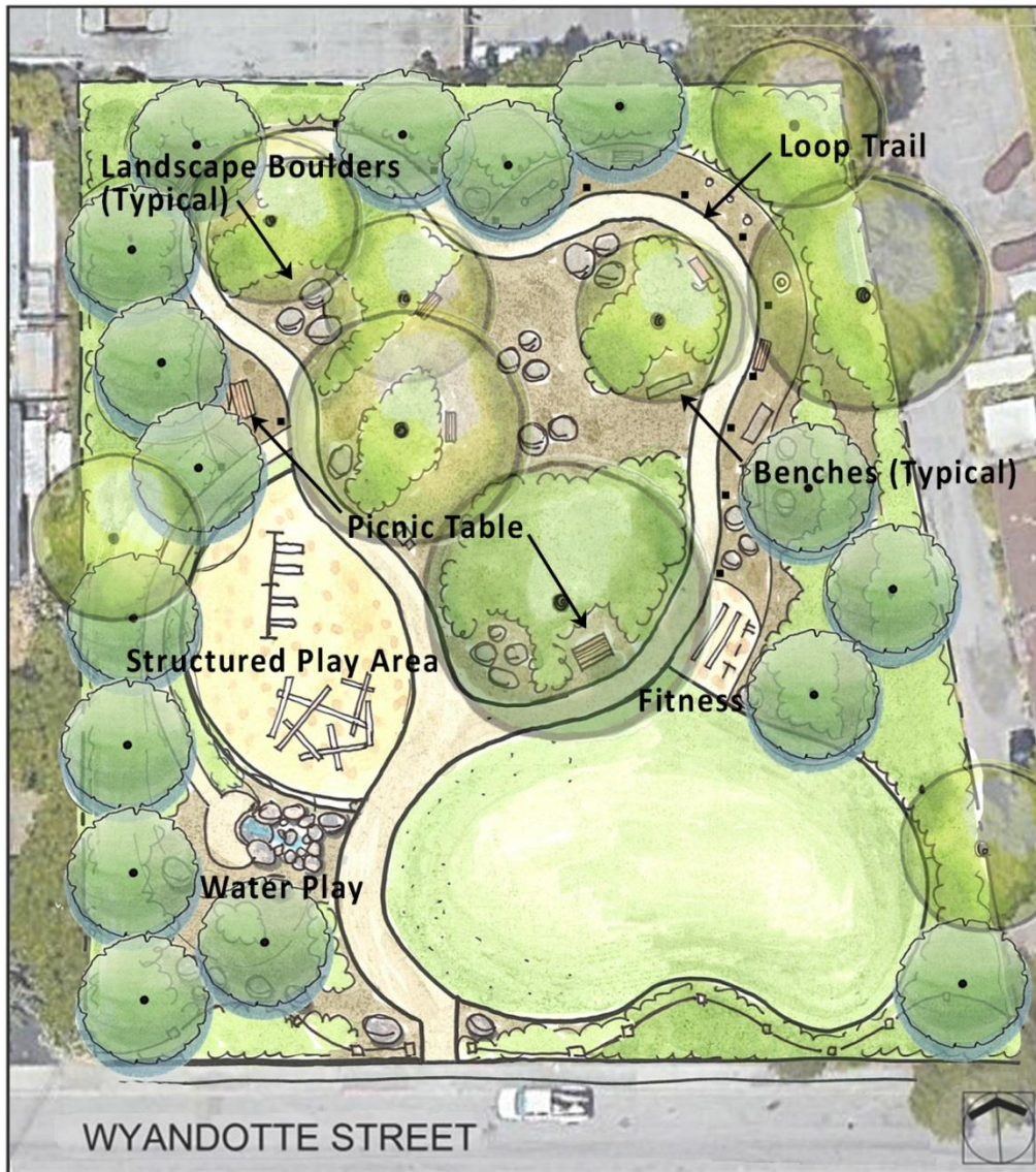
Figure 1 – Council-Approved Concept Plan