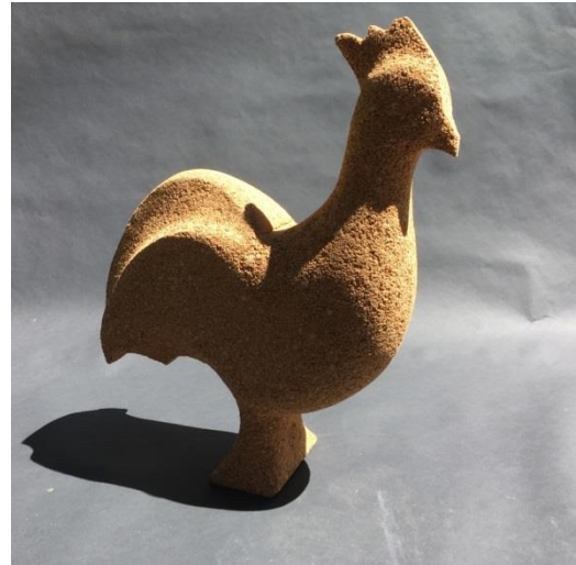
Figure 5 - Chicken Concept

At the May 8, 2019 VAC meeting, the Committee reviewed the additional information from the remaining top two artists and formally selected Ene Osteras-Constable as the best qualified artist. The artist can provide five bronze cast chickens, each 20" tall within the art budget. (See Figure 5—Chicken Concept.) The original sculptures will be hand-carved in cork, as shown in the figure, and the final patina will be bronze, similar to the patina shown in Figure 2. The chickens reflect the neighborhood history surrounding the park which was known for large chicken farms in the early 1900s. When the area was developed, streets in the area were named after chicken breeds, such as wyandotte, leghorn, plymouth, and rock. Staff will work with the artist to select suitable locations for the art throughout the park.