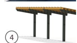
VILLA MINI PARK / Conceptual Design B