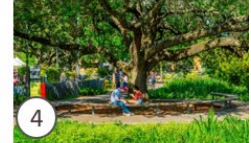
VILLA MINI PARK / Conceptual Design A