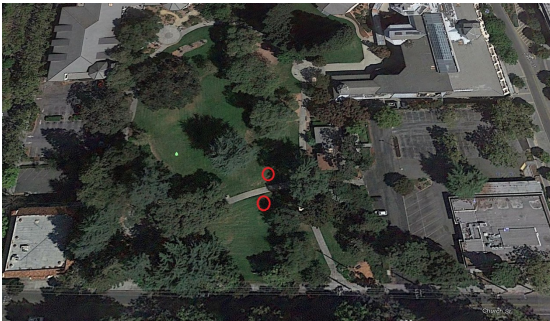
New Valley Oak Locations

Staff proposes two new 24" box valley oak trees as mitigation for the loss of the Heritage-sized flowering cherry tree. This would fulfill the 2:1 replacement requirement when trees are impacted by construction.