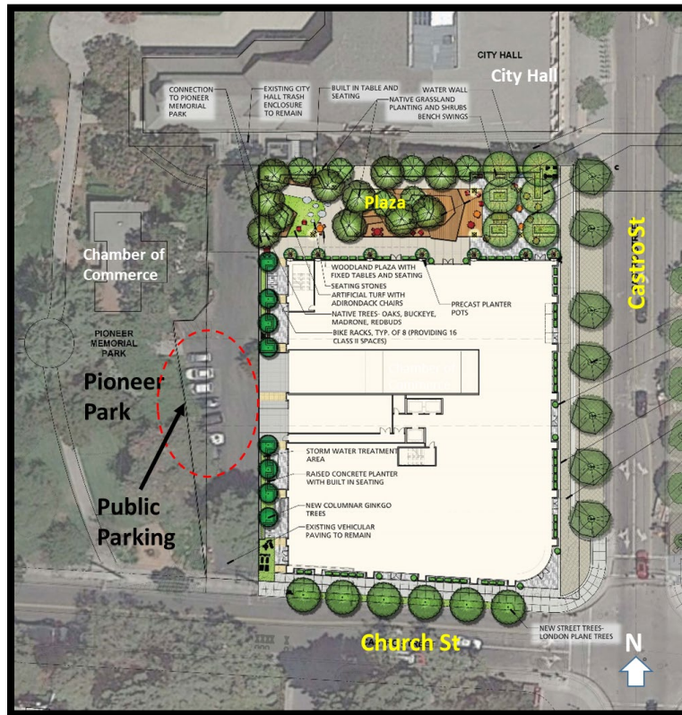
Figure 2: Public Parking Location

In compliance with the Downtown Precise Plan, The Sobrato Organization project is proposing a generous landscape plaza connecting Castro Street to Pioneer Memorial Park. This landscape plaza connection area includes the existing City land adjacent to a City trash enclosure (see Figure 2). As part of the 590 Castro Street development project, the applicant is proposing to resurface this portion of the City land by converting 391 square feet of impervious area into the landscaped plaza to provide better connection between the park and Castro Street. This would result in a net gain of 76 square feet of pervious area between the loss due to parking replacement and gain due to conversion into a landscaped plaza.