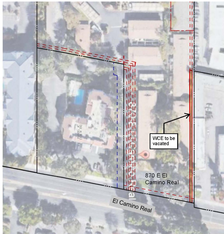
Figure 2: Easement Locations