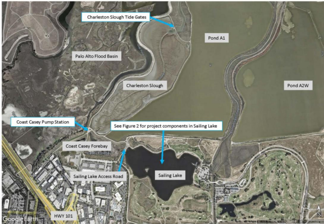
Figure 1: Project Location Map at Shoreline at Mountain View and Charleston Slough

The Sailing Lake intake pump station, located at the southern limit of Charleston Slough, provides water supply to the Sailing Lake to maintain the lake water quality for habitat and recreational use.