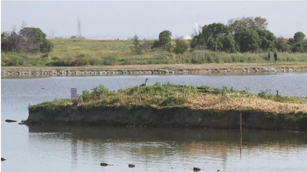
Figure 6: Sailing Lake Habitat Island Project Component