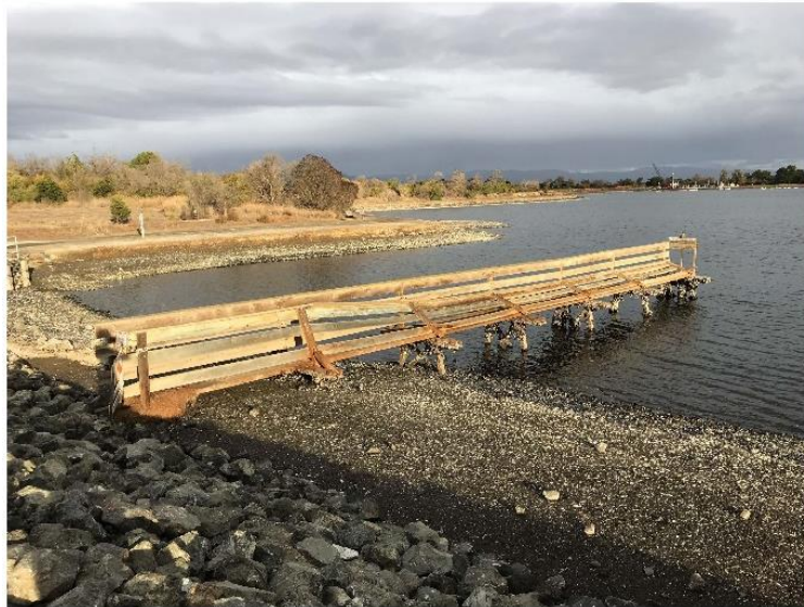
Figure 4: Sailing Lake Access Road Boardwalk Project Component