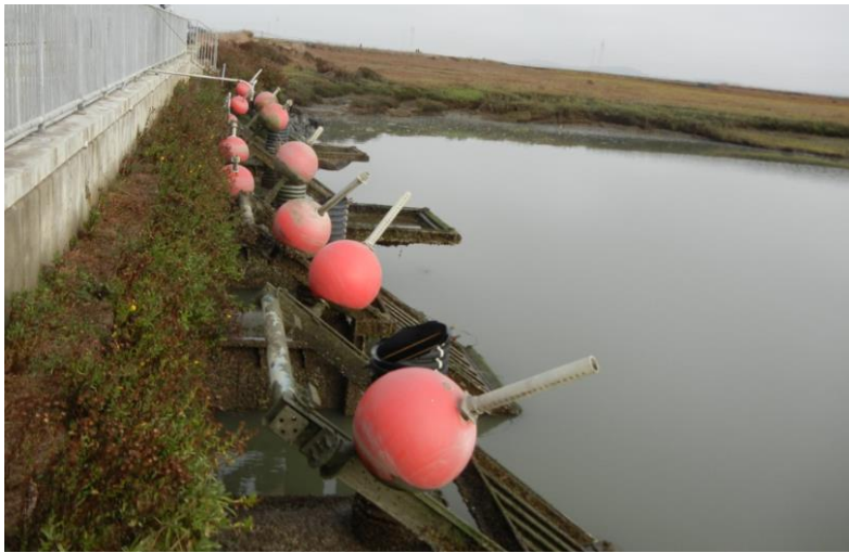
Figure 3: Charleston Slough Tide Gates Project Component