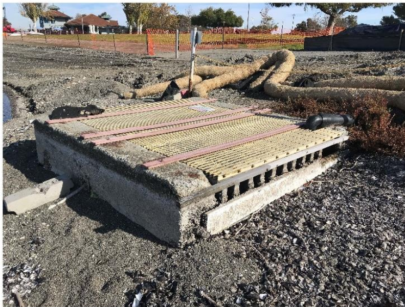
Figure 5: Sailing Lake Outlet Project Component