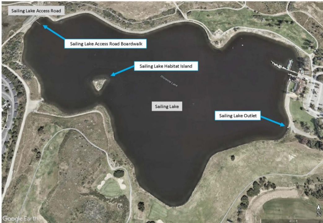
Figure 2: Project Components at Sailing Lake in Shoreline at Mountain View

The Sailing Lake, also known as Shoreline Sailing Lake, is an artificial water body in Shoreline at Mountain View, with an area of 45 acres and an average depth of 18', used for kayaking, sailing, and windsurfing. The Sailing Lake is a closed-water body with the Sailing Lake water supply provided by the Sailing Lake pump station. The lake level is maintained constant by a concrete outlet structure that discharges to Permanente Creek. At the western limit of the Sailing Lake, adjacent to the Coast-Casey Forebay, is the Sailing Lake Access Road. The road serves as a California Department of Water Resources, Division of Safety of Dams (DSOD), jurisdictional dam which was improved in 2021 to enhance its stability and to reduce its breaching risk to the Coast-Casey Forebay. It also provides an access route for construction and maintenance projects along the shoreline.