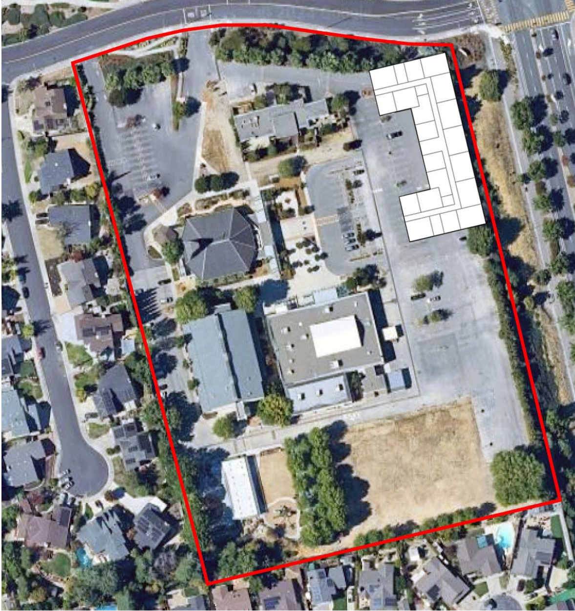
Figure 2: Large Site Layout