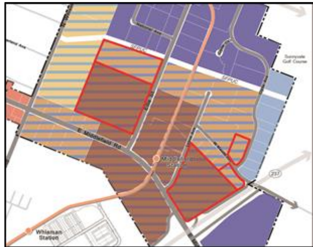
Additional Residential Areas