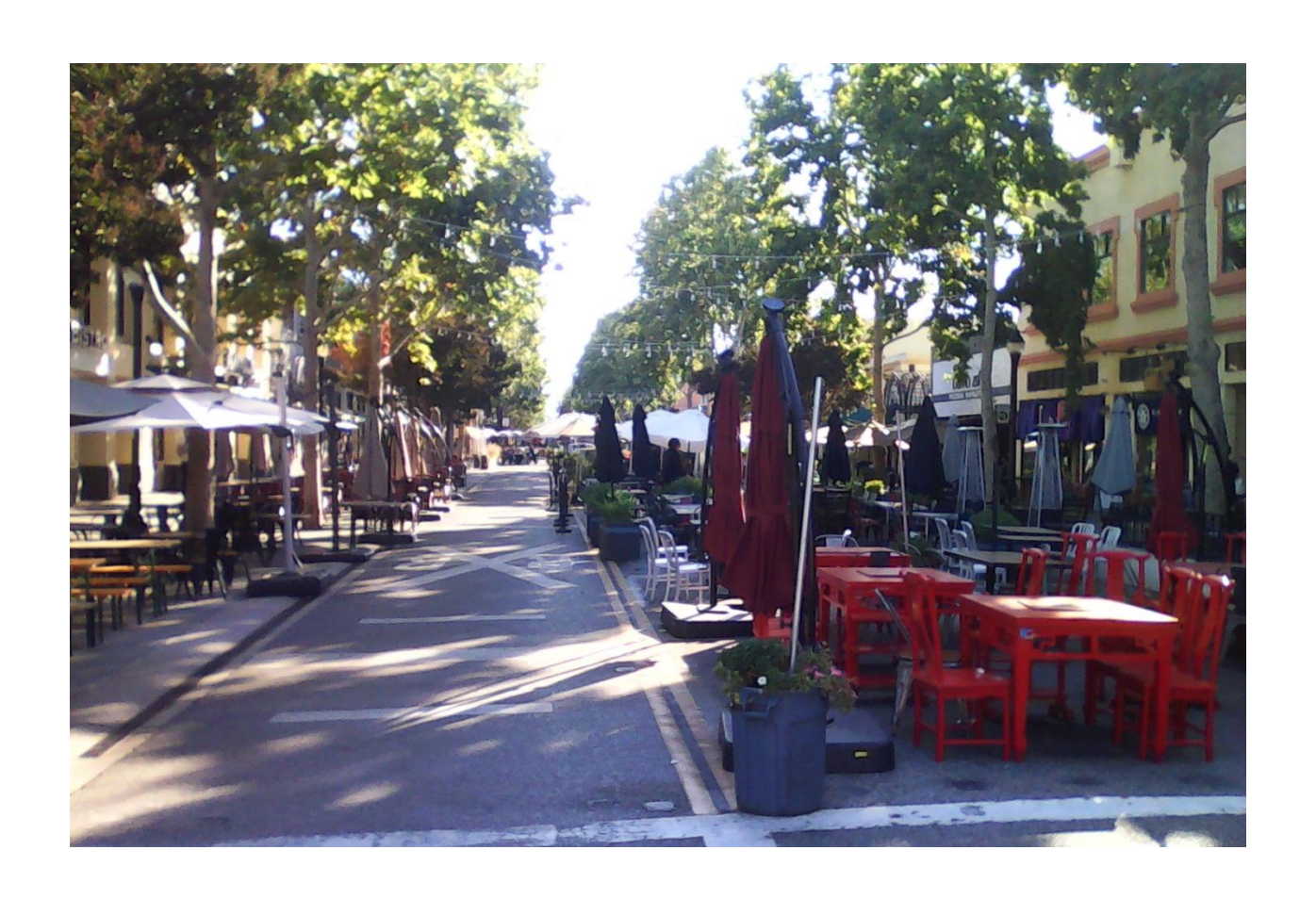
100 block Castro Street 9/27/22 P.M.