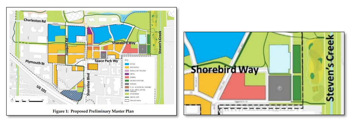
Figure 2: Preliminary Master Plan, March 2021

The March 2021 Preliminary Master Plan proposal included a district parking garage (shown in grey) at the end of Shorebird Way and adjacent to a proposed school site (Shorebird wilds) shown in coral block below (figure 2). At the March 23, 2021, meeting, Council provided feedback on the preliminary master plan and recommended relocating the district parking garage to ensure pedestrian and bicyclist safety near proposed school site. Subsequently, the applicant submitted a formal master plan with revised land use plan removing the district parking garage and introducing market rate residential use adjacent to the school site.