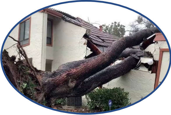
Increasing Storm Frequency and Severity