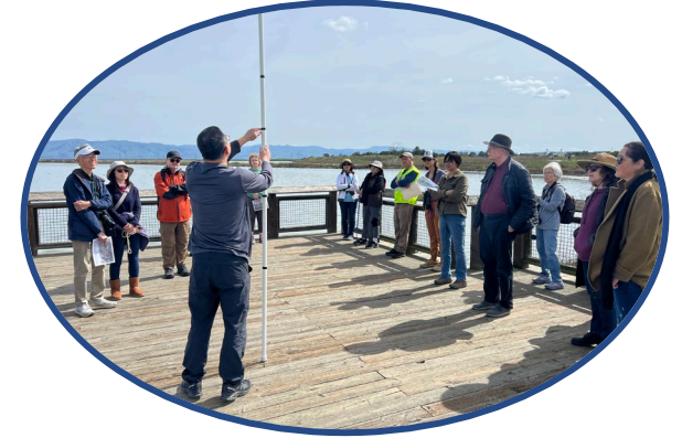
Sea level rise & flooding