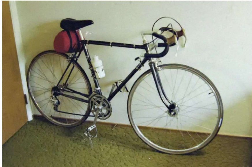
My 1979 Trek Bicycle