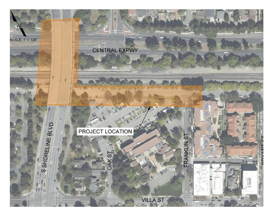
Figure 3: Shoreline Boulevard to Evelyn Avenue GSAP footprint

According to the terms of the Cooperative Agreement, Caltrain will complete the final GSAP project design and will bid the project for construction. VTA will provide $10 million toward the final design costs directly to Caltrain. The City will separately fund its responsibilities and support, which will count toward the City's required minimum 10% local match for Measure B funds used on project design and construction.