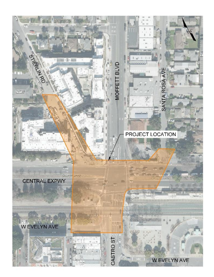
Figure 2: Castro Street GSAP Footprint