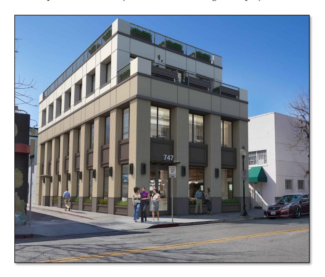
Figure 3: View from West Dana Street

The proposed project utilizes an architectural style that includes flat roofs, well-proportioned terracotta glazed columns expanding across the building facade, and smooth cement plaster. The ground floor is further emphasized with heavy recesses, glass and metal awnings, large expanses of transparent storefront, and landscaping to improve the pedestrian environment. The architectural form is generally consistent with the flat-roofed architecture of the surrounding buildings, and the use of terracotta columns is compatible with the adjacent historic building to the project's west.