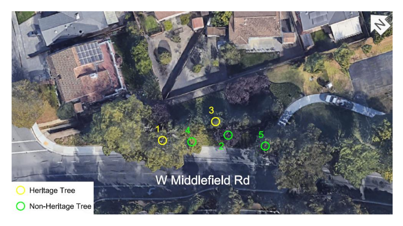
Figure 3: Proposed Tree Removals at San Veron Park