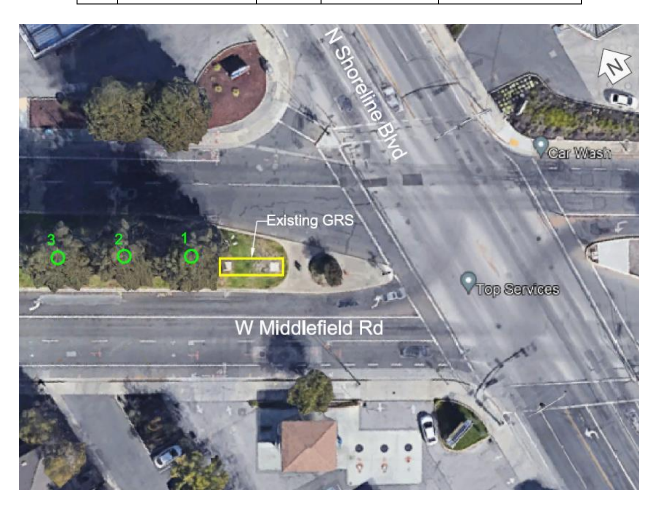
Figure 5: Median trees on West Middlefield Road at North Shoreline Boulevard