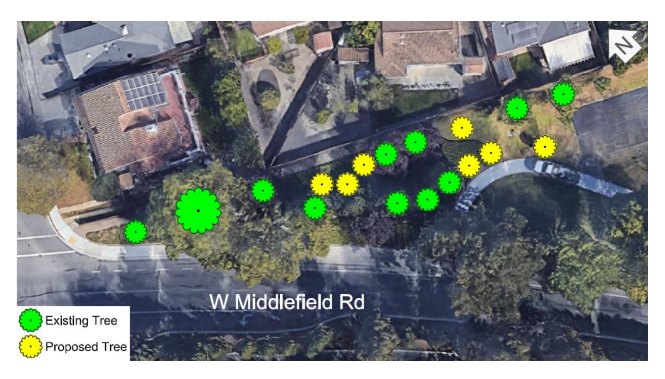
Figure 4: Proposed Tree Replacements at San Veron Park