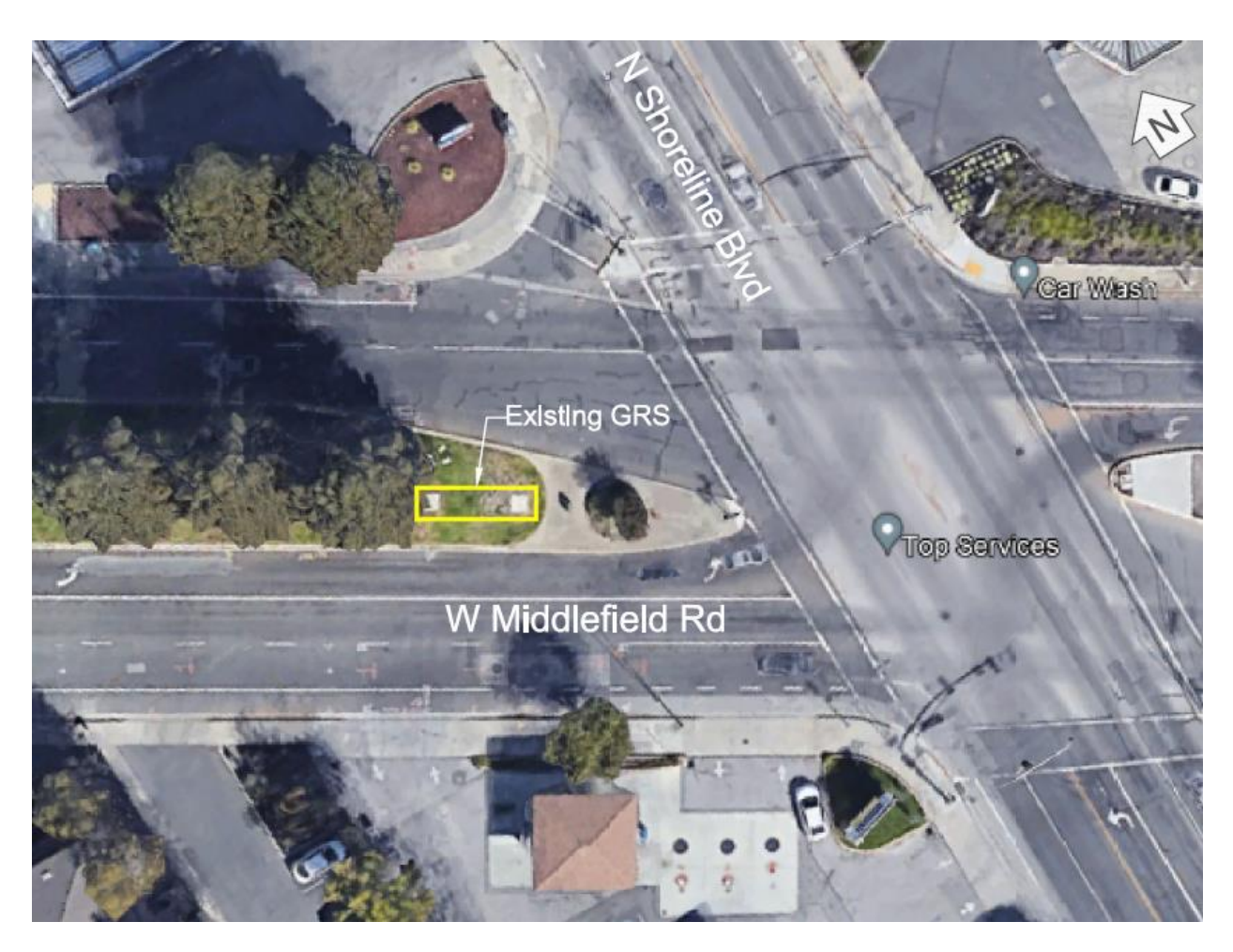
Figure 1: Location of Existing GRS