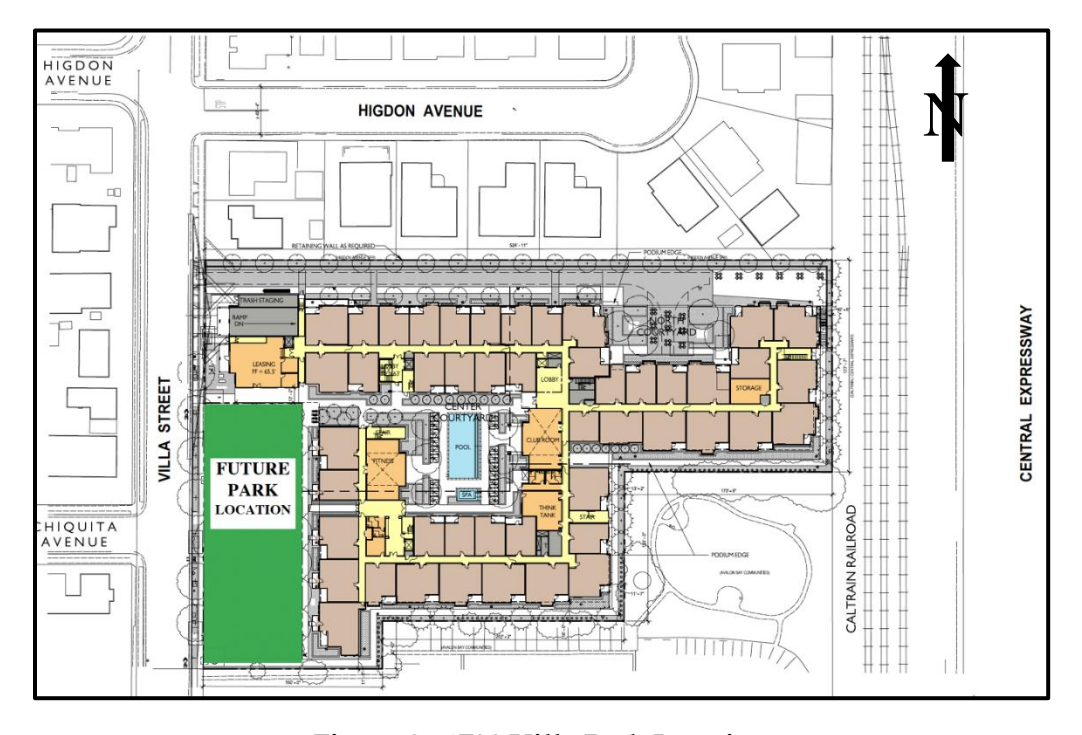
Figure 2: 1720 Villa Park Location