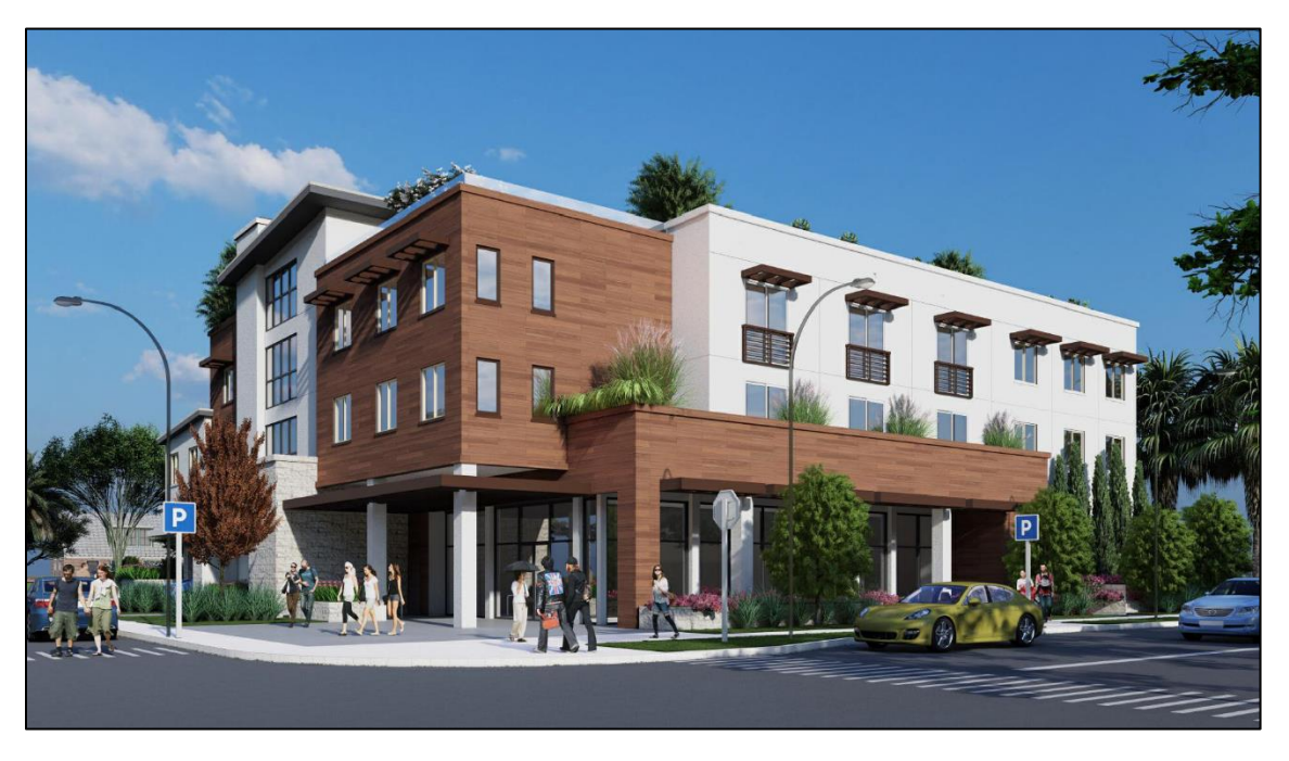
Figure 5: View from Escuela Avenue

Staff is supportive of the setback and height exceptions because they accommodate design features, such as the balconies and roof form, which improve the character of the development, and are elements required by Building Code, like the elevator overrun, which support the roof deck.