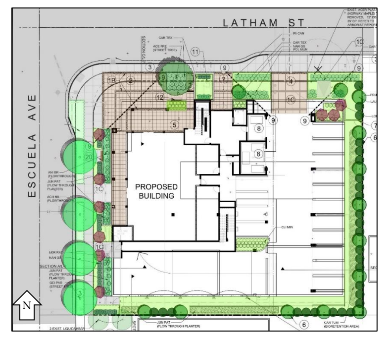
Figure 4: Site Plan

The applicant proposes to develop a new three-story, mixed-use building with 2,400 square feet of ground-floor retail space and 25 residential apartment units on the two floors above. The proposed unit mix is comprised of 10 studios, 11 one-bedroom units, and four two-bedroom units. A courtyard is proposed on the second floor, and a roof deck is proposed on the top of the third floor. Parking is located at-grade and in a one-level, below-grade parking garage. Vehicle access to the site is available from Latham Street, and no vehicle access is provided on Escuela Avenue to maintain a safe pedestrian corridor between El Camino Real and Castro School (see Attachment 6- Project Plans).