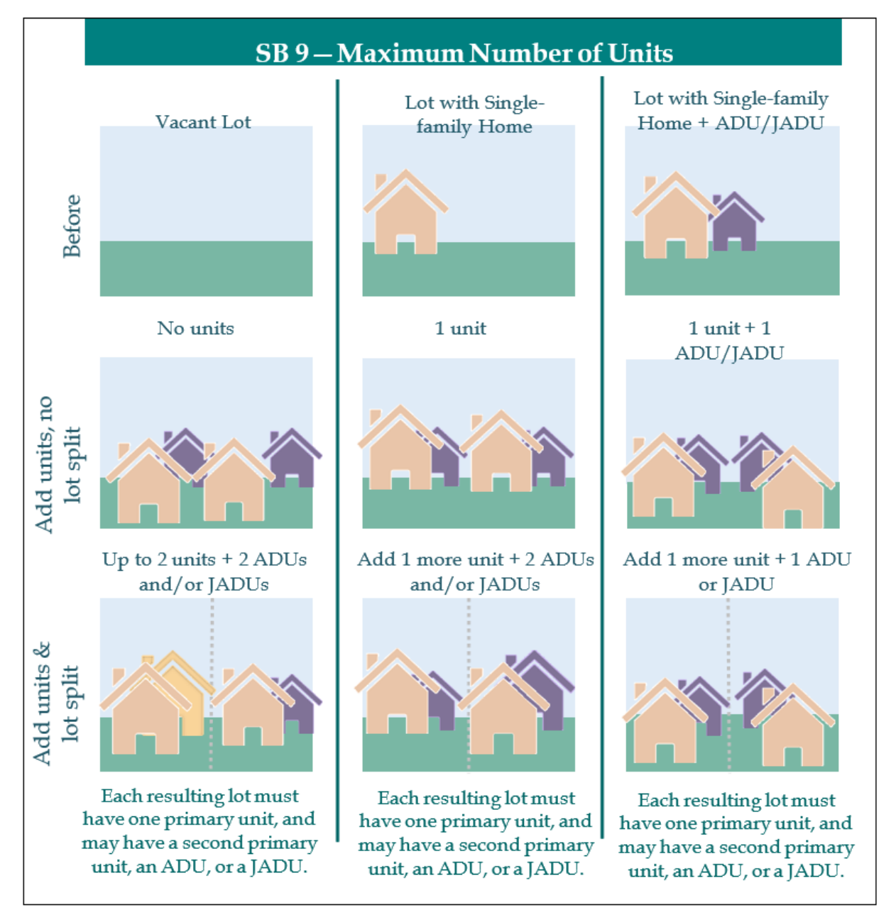
Figure 2: SB 9 Maximum Number of Units

California Senate Bill 9—Text Amendments to Chapter 28 (Subdivisions) and Chapter 36 (Zoning) of the City Code and Other Minor Text Amendments March 22, 2022 Page 13 of 16