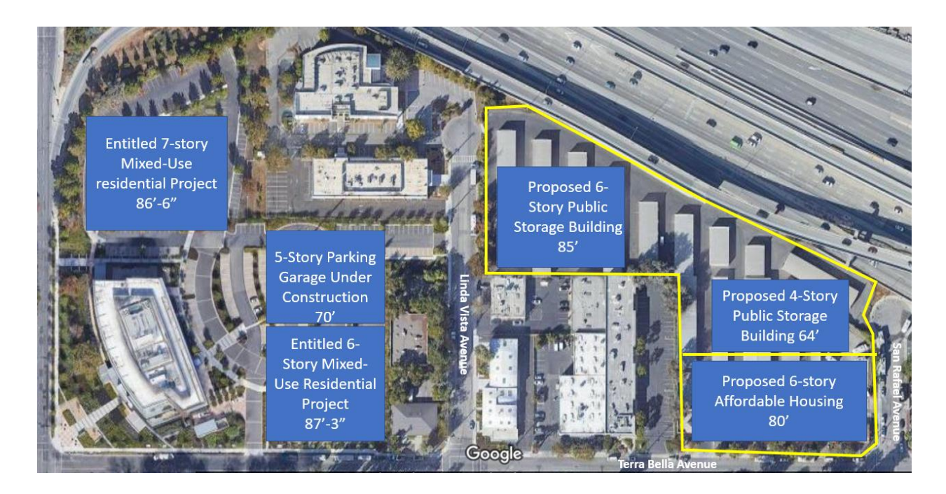
Figure 5—Neighborhood Height Context

The evolving context of the neighborhood has guided staff analysis of the proposed changes to the project proposal. Specifically, staff feels the increased height in the Phase-One building—from five stories (72') in the original plans, to six stories (85') in the current submittal—can be supported as it would be similar to the existing/future scale of nearby development, where five- to seven-story buildings range in height from 70' to 88' in height. However, additional design work is needed to support this increased height and more prominent building view and to ensure the proposed buildings will fit into the evolving mixed-use neighborhood, as discussed in more detail below.