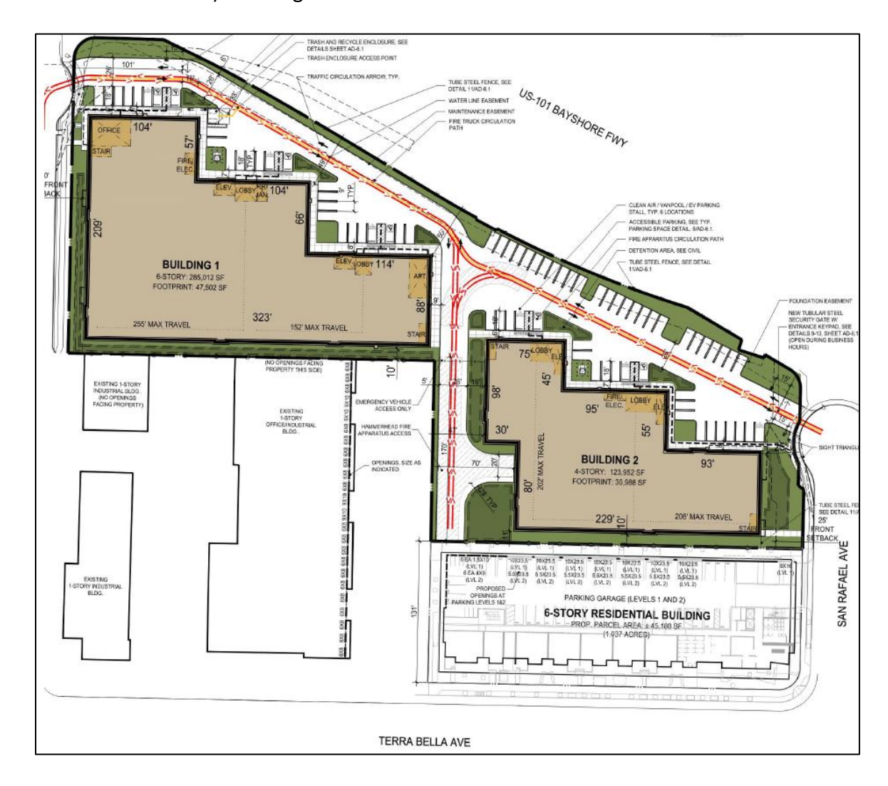
Figure 2—Combined Site Plan

Alta Housing site at the corner of Terra Bella and San Rafael Avenues, while the majority of the Public Storage site is located behind the Alta site, with access via a driveway on Terra Bella Avenue and a second access from the cul-de-sac side streets (San Rafael and Linda Vista Avenues)—see Figure 2.