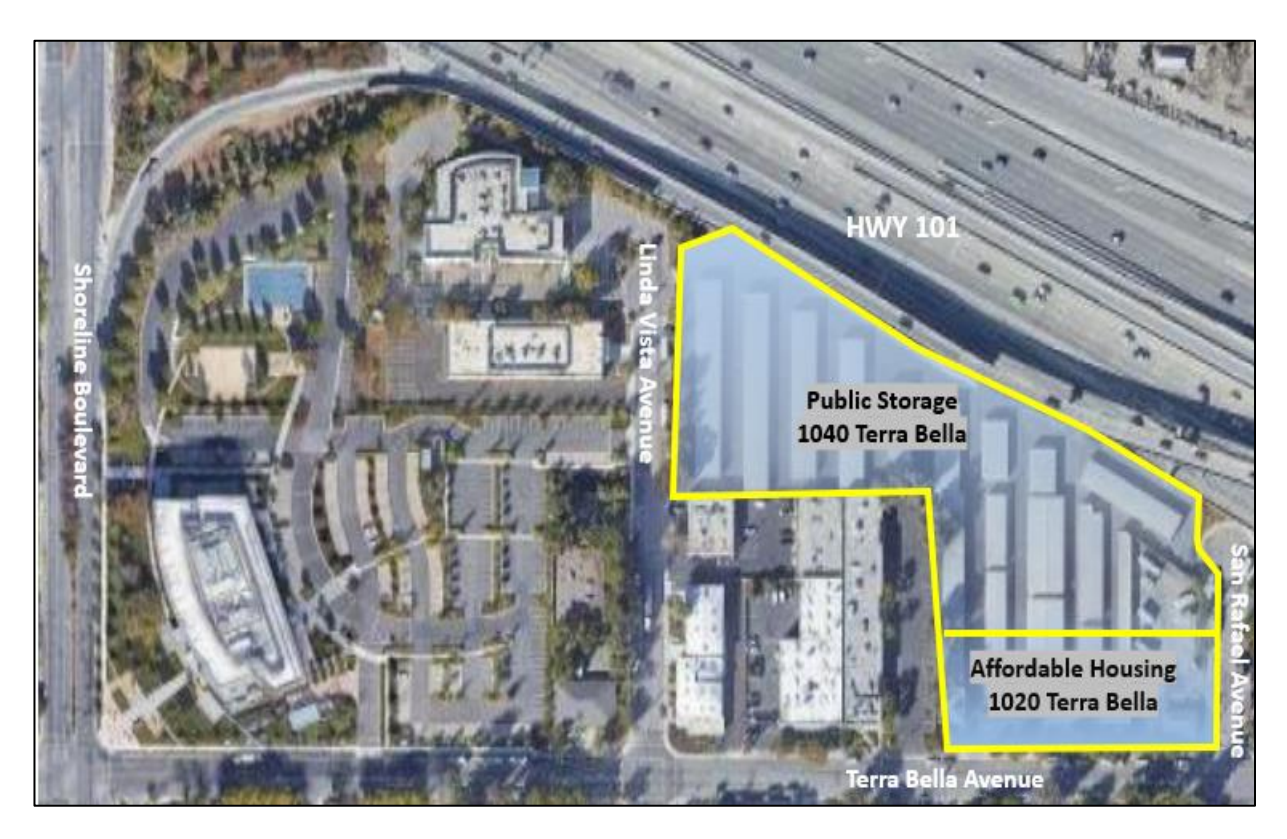
Figure 1—Location Map

U.S. 101, including an off-ramp to Highway 85 to the north; several industrial offices and research and development offices (one to two stories) to the south; industrial offices and research and development offices (one story) to the east; and a mixture of recently entitled multi-family projects with commercial space (five to seven stories), an existing Google office building (four stories), the Scientology site (two stories), and industrial and research and development offices (one story) to the proposed development.