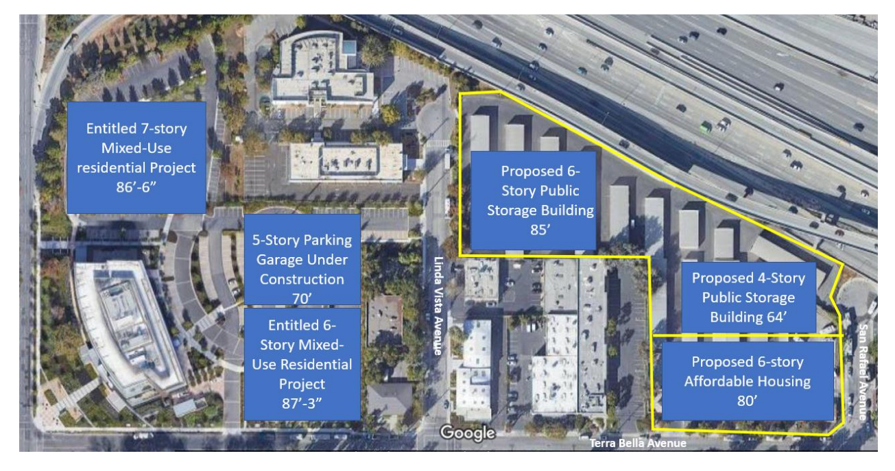
Figure 5—Neighborhood Height Context

1001 North Shoreline Boulevard. Newer two- to three-story office buildings have also been constructed or are currently under review in the vicinity.