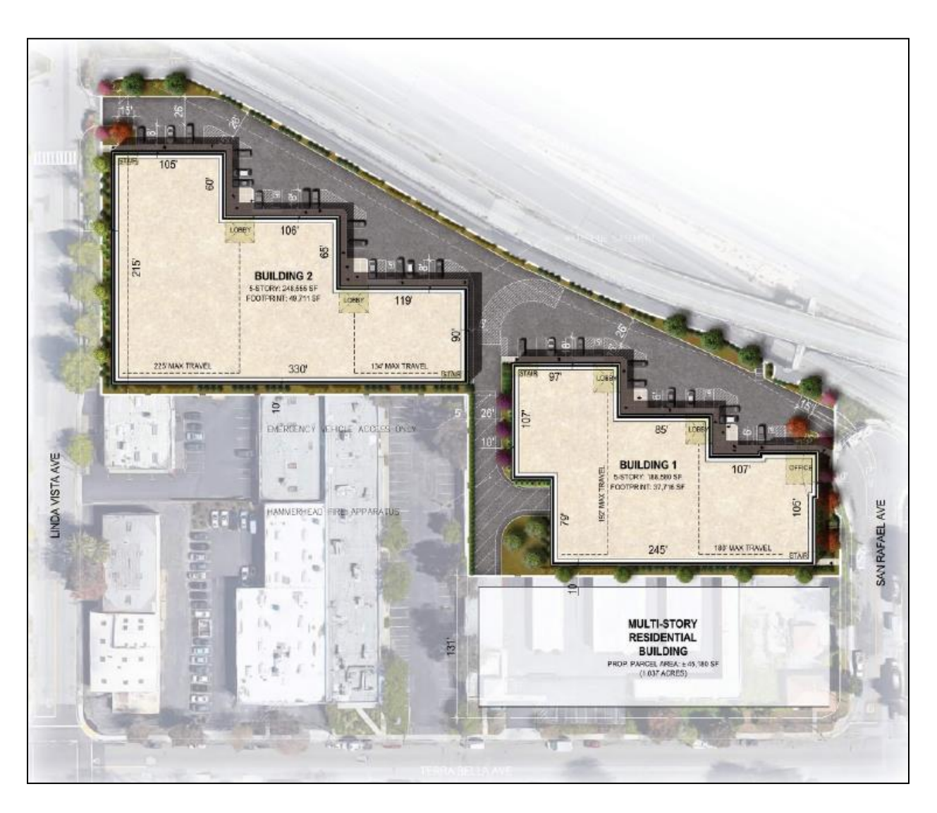
Figure 2—Combined Site Plan