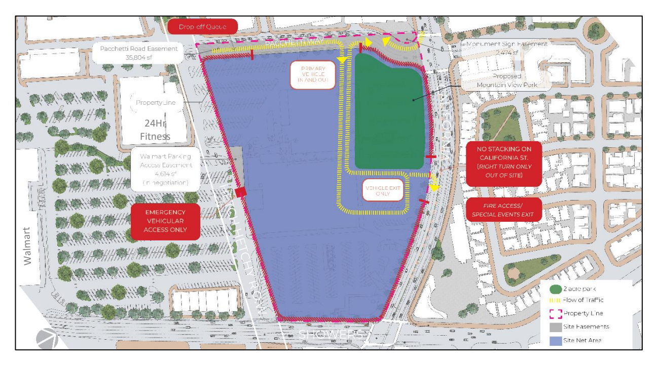
Figure 1: City Park Location

On October 26, 2021, the City Council held a Study Session to receive a general update on the collaborative master planning work with LASD and consider initial recommendations from City staff on the City park location. By consensus, Council supported staff's recommended park location (see Figure 1) and staff's continued collaborative work with LASD to maximize the park's size.