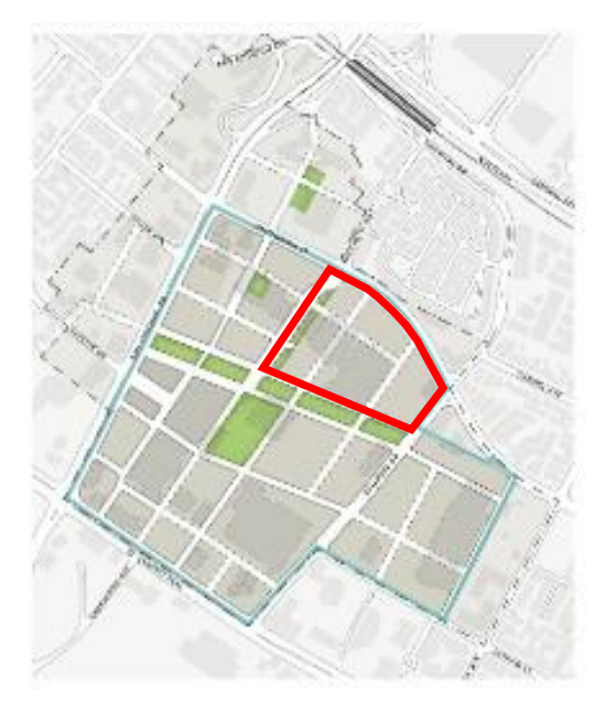
Figure 3: SAPP Open Space Plan

located adjacent to each other, separated only by access roads or parking areas (if anything). The proposed layout meets this objective better than the alternative option as the City park and JUOS would likely be separated only by the school driveway, whereas the alternative option would likely feature a larger parking area between the City park and JUOS areas.