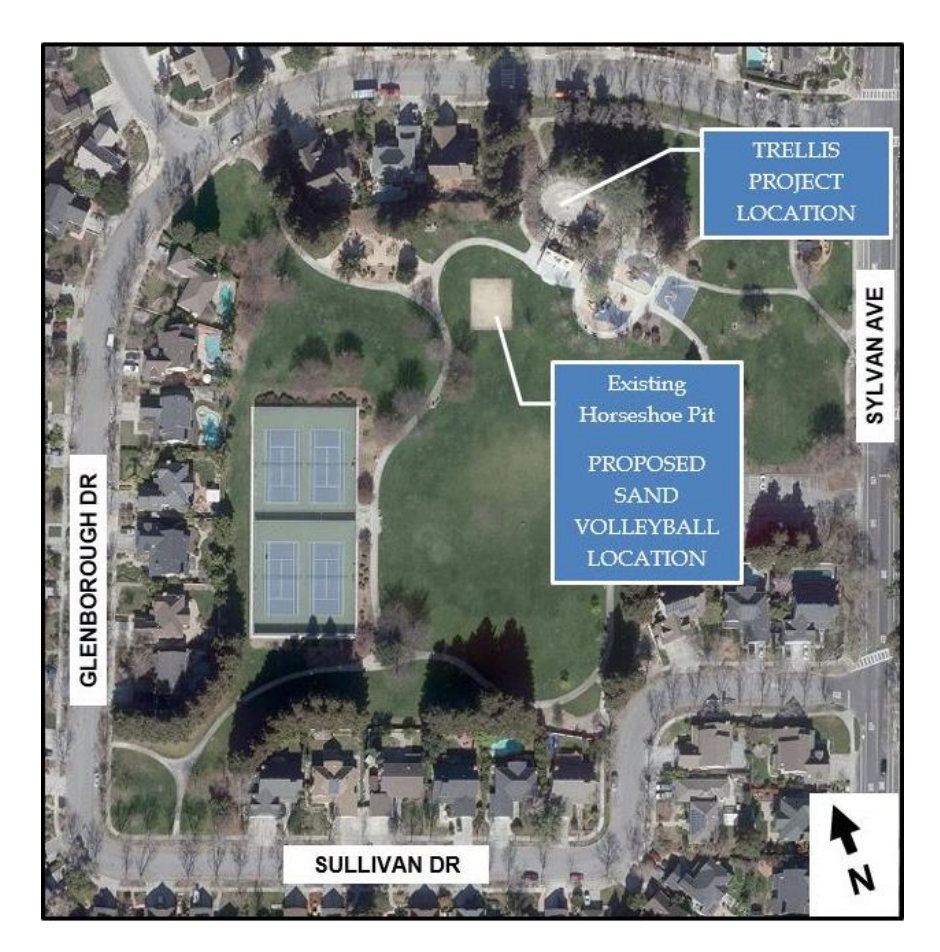
Figure 1: Location Map—Sylvan Park Improvements