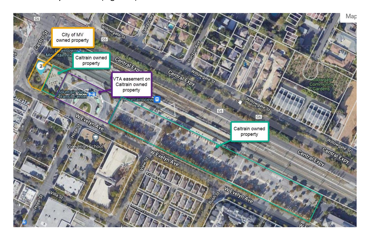
Figure 3: Mountain View Transit Center Property Ownership

The Transit Center includes Caltrain and VTA light rail stations, several VTA bus lines, public and private shuttle bus service, transit station parking and bicycle parking facilities. Caltrain owns most of the six-acre site, the Santa Clara Valley Transportation Authority (VTA) has easement rights over a portion of Caltrain's property, and the City owns a small parcel adjacent to Castro Street and Evelyn Avenue (Figure 3).