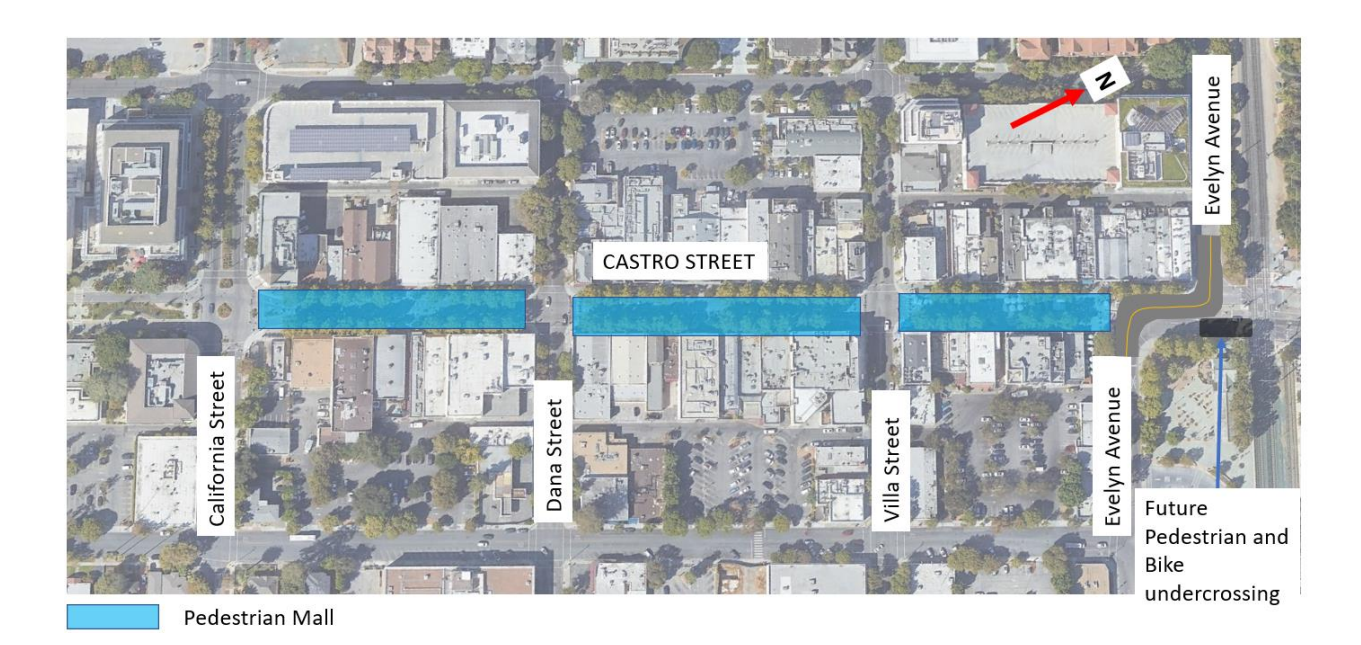
Figure 2: Castro Pedestrian Mall Extents

The recommended Resolution of Intent sets a public hearing date of October 11, 2022, specifies a process for property owners and tenants to submit claims for damages, indicates that the City's General Fund will be used to pay for any damages, and identifies general improvements related to traffic control that will be paid for by the City. With these provisions, the recommended Resolution of Intent satisfies the Law's requirements.