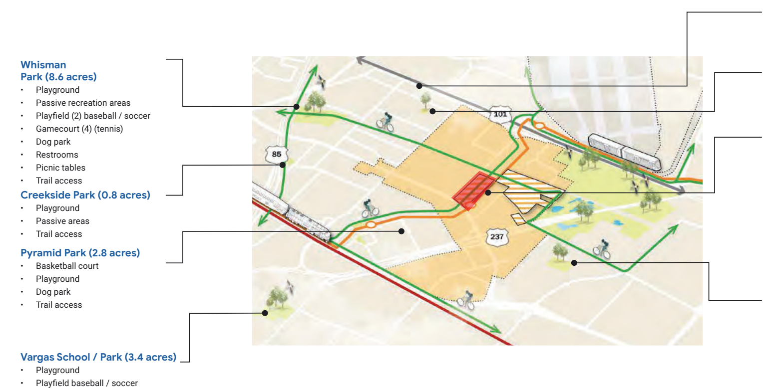
Figure 6.11.3 Complementing nearby parks and park elements