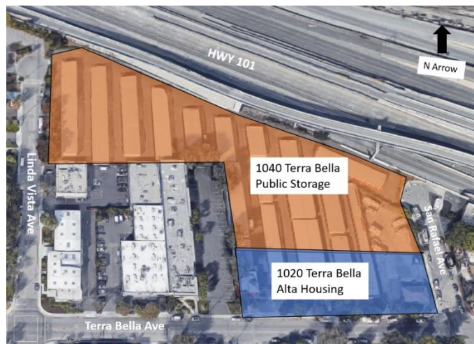
Figure 1: Locational Map