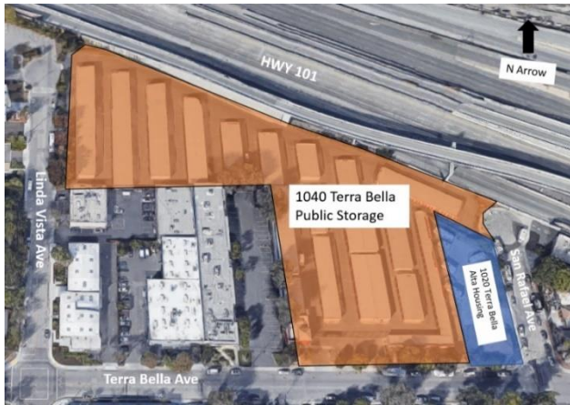
Figure 2: Existing Project Parcels