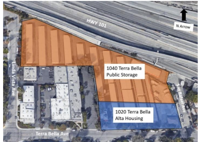
Figure 3: Proposed Project Parcels