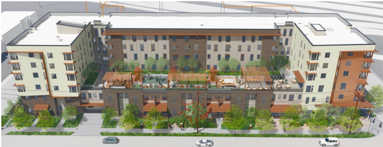
Figure 7: Project View from Terra Bella Avenue

The building has a simple, modern design. The building is clad with horizontal fiber cement siding, delineated by a mix of widely spaced vertical battens and recessed reveals, with vertical standing seam metal siding applied to the upper floors of each building end/corner. The two building corners facing Terra Bella Avenue feature angled inset walls with projecting fins to highlight this building accent. The ground-floor facade and windows are accented with steel awnings, sunshade elements, or trim details intended to provide visual interest and/or pedestrian-oriented features.