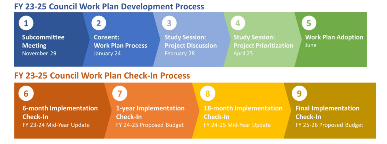
Figure 2: Council Work Plan Development and Check-In Process