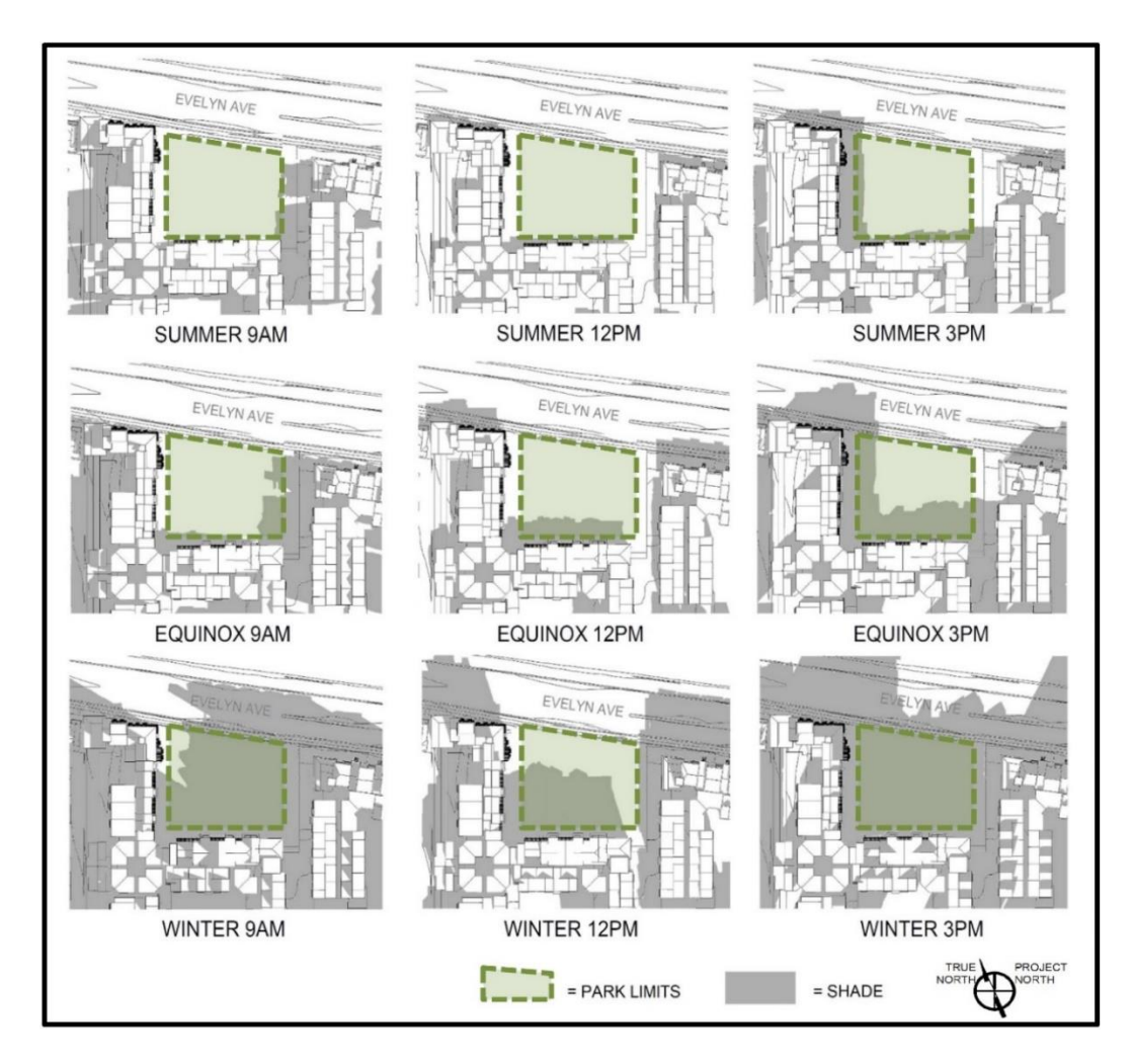
Figure 4: Site Solar Study