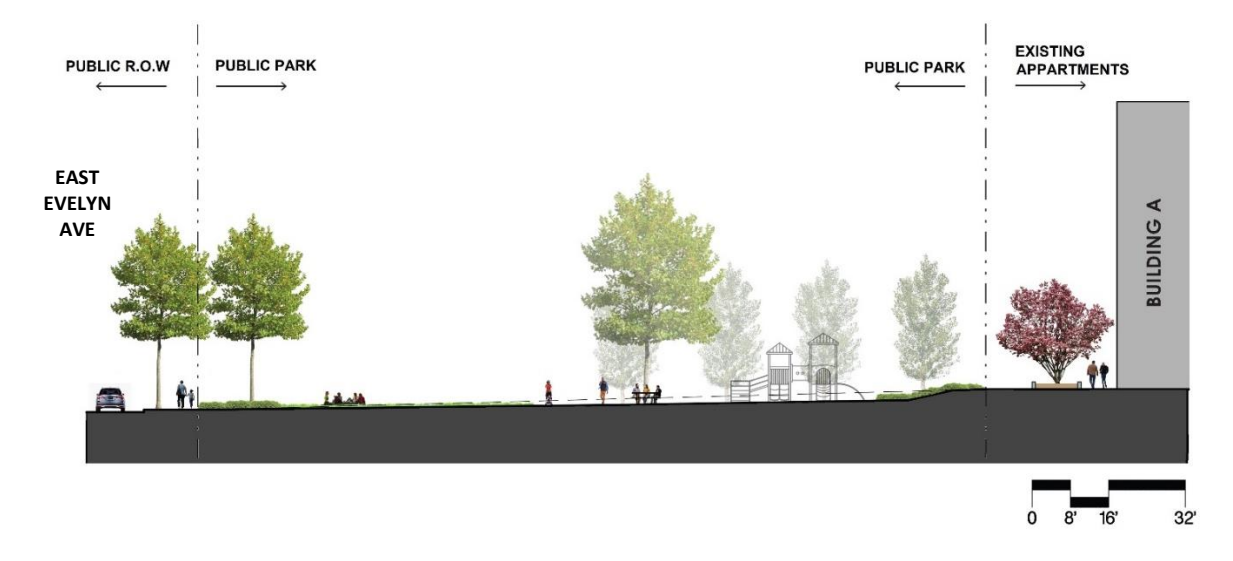
Figure 5: Site Cross Section N-S