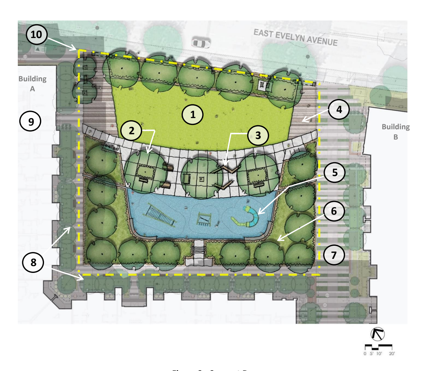
Figure 2: Concept D