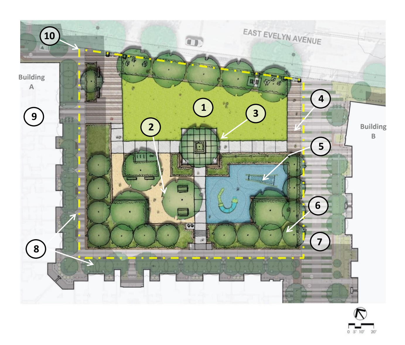
Figure 3. Concept E