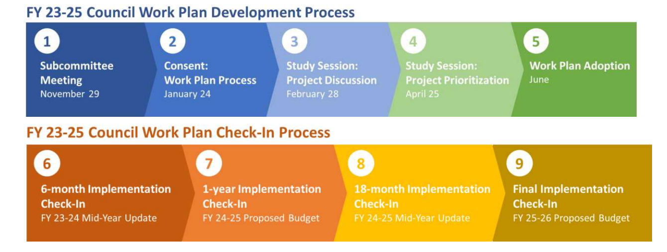
Figure 2: Council Work Plan Development and Check-In Process