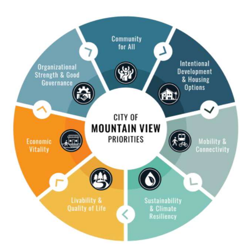
Figure 1: Council Strategic Priorities

In June 2021, Council adopted a Vision Statement and seven Strategic Priorities, also referred to as the Council's Major Goals (see Figure 1 above) based on an extensive process with direction from Council and input from the community and City staff. This process, facilitated by a consultant, was conducted to provide an opportunity to refresh Council's overarching vision and priorities. As discussed later in this memorandum, along with the Strategic Priorities, Council also adopted a work plan of related projects.