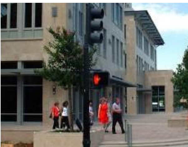
Fig. H.22: Both small and large-scale new development should preserve the rhythm and fine-grained pedestrian scale of existing buildings within the Historic Retail District by respecting the relatively narrow building increments, which are predominantly 25' to 50'.