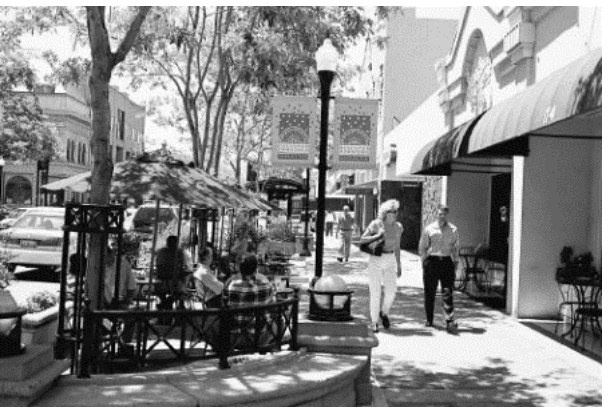
Fig. H.21: Outdoor patios and an engaging pedestrian experience Downtown.

In order to create well-defined street spaces consistent with the scale of downtown Mountain View, side yards are discouraged in favor of contiguous building facades along the street. However, narrow mid-block pedestrian passages that encourage through-block pedestrian circulation and/or arcaded spaces that create wider sidewalk areas for cafés, etc. are encouraged.