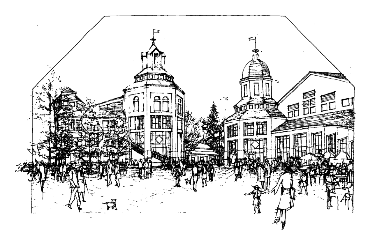
MOUNTAIN · VIEW · CIVIC · CENTER

Administration of this Precise Plan shall be in accordance with Mountain View City Code, Article A36.50, XVI, Division 1, Authority for Land Use and Zoning Decisions.