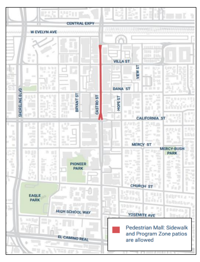
Figure 2: Pedestrian Mall Boundaries

In preparation of adoption, a Council ad hoc committee was created to review and provide direction for the design standards and guidelines for the Castro Street Pedestrian Mall. On March 20, 2023, the Council ad hoc committee reviewed the following items and recommended approval to the City Council: