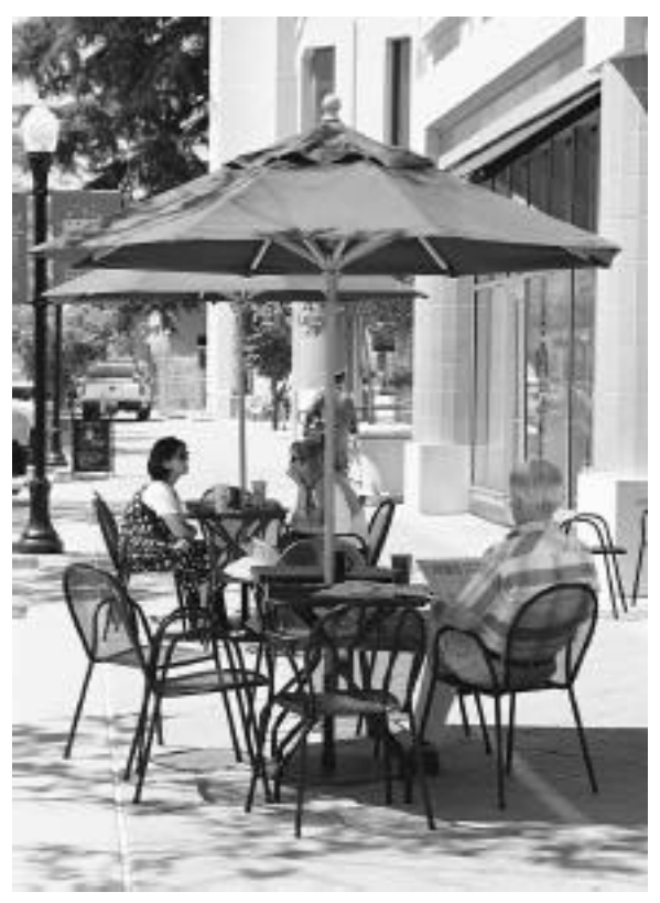
Sidewalk Cafes Outdoor dining on Castro Street.

Downtown Mountain View is largely perceived as the four blocks on either side of Castro Street between Evelyn Avenue and Mercy Street, comprising the historic retail district of the City. There is also a mix of uses in the areas on either side of the historic Castro Street commercial district. As shown on the following map (Figure 1), the boundaries of the Downtown Precise Plan include the historic Castro Street retail district, the central office core area and areas south of Mercy Street, including the new Civic Center and City Centre mixeduse project. Downtown Mountain View is surrounded by predominantly single-family neighborhoods. The changes in land use, building scale and activity mark the boundaries between these areas. Mountain View's Parking Assessment District is another boundary within the Downtown Precise Plan area. The Parking District allows for the assessment of fees for maintenance of public parking facilities. Additionally, the Revitalization District includes approximately 68 acres and is an area comprising 16 City blocks bounded by Evelyn Avenue on the north, View Street on the east, Mercy Street on the south and Franklin Street on the west. In general, the goal of the Revitalization District is to ensure downtown remains vibrant through economic development, building, streetscape and parking improvements, and community outreach.