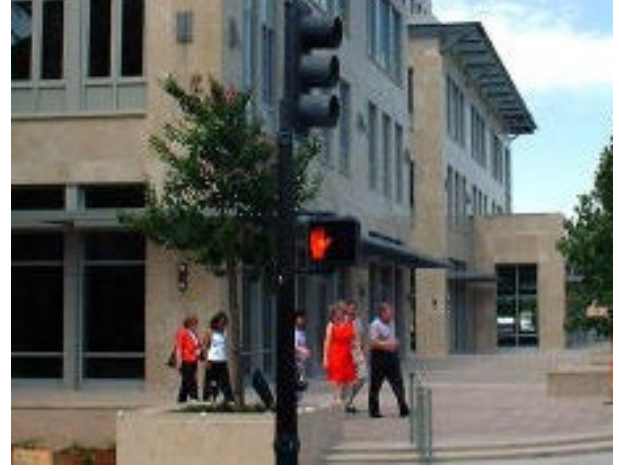
Fig. H.22: Both small and large-scale new development should preserve the rhythm and fine-grained pedestrian scale of existing buildings within the Historic Retail District by respecting the relatively narrow building increments, which are predominantly 25' to 50'.